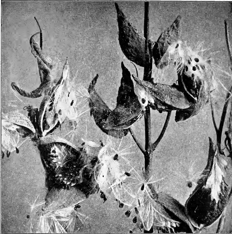
A familiar form of Asclepias