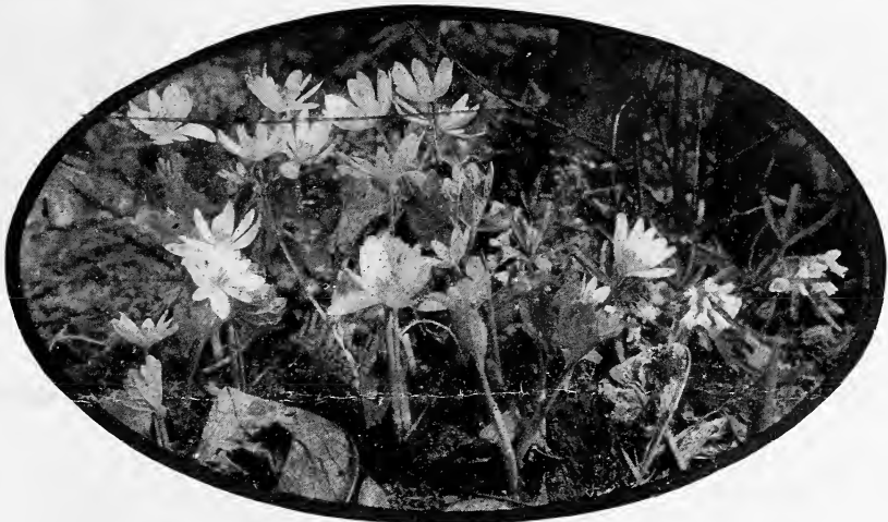
Sanguinaria canadensis (Bloodroot)