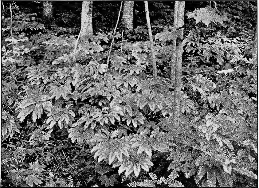
Adiantum pedatum , American Maidenhair Fern