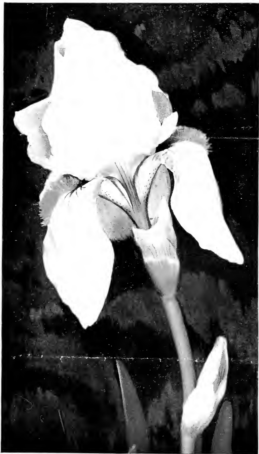
Mother of Pearl (Sturtevant)