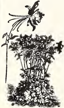
Aquilegia— Long-Spurred Columbine

Prices: Each, 10c; dozen, $1.00; 100 assorted, $7.50.