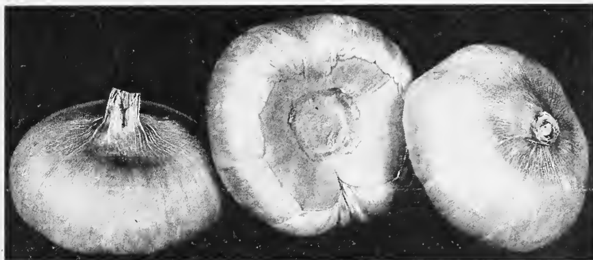
Over 100 varieties—and they're "WELL GROWN"