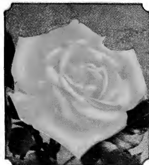
Souv. de Claudius Pernet

This 1927 Star Dozen does not include one variety offered in the original dozen twenty years ago, because our policy has been that the Star Dozen must contain the most up-to-date, tried and proven, best Roses. Each year one or two varieties are dropped out to make room for other superior kinds that have stood our rigid test for this dozen and have scored higher points than the ones that are dropped. We cannot make a dozen more than twelve, so we have raised the standard of the twelve.