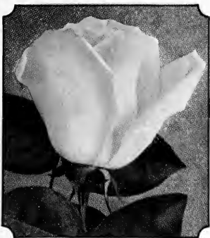
Duchess of Wellington