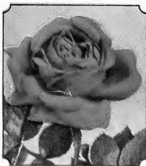
Etoile de France

★ Mme. Butterfly. H.T. This American sport of the favorite Ophelia has delicately modeled flowers of tender pink and gold, and is one of the sweetest and most pleasing Roses. Its lovely spiral buds slowly unfold into big flowers, though not very full, of charming shape and dreamy color, very highly scented, and lasting unusually long. The stems are fine and very strong, making it one of the best Roses