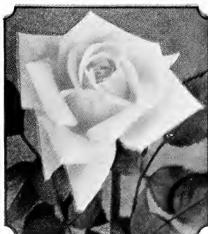
Mrs. Aaron Ward