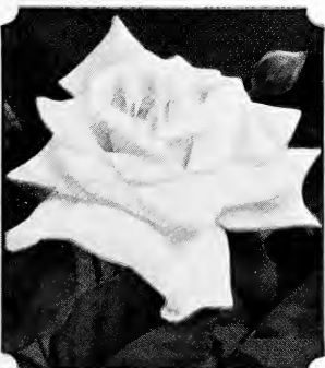
Kaiserin Auguste Viktoria

★ Duchess of Wellington. H.T. The best freeblooming yellow Rose to date. Its lovely buds of glowing yellow are washed with carmine. They are very long and pointed and unfold slowly, changing from deep