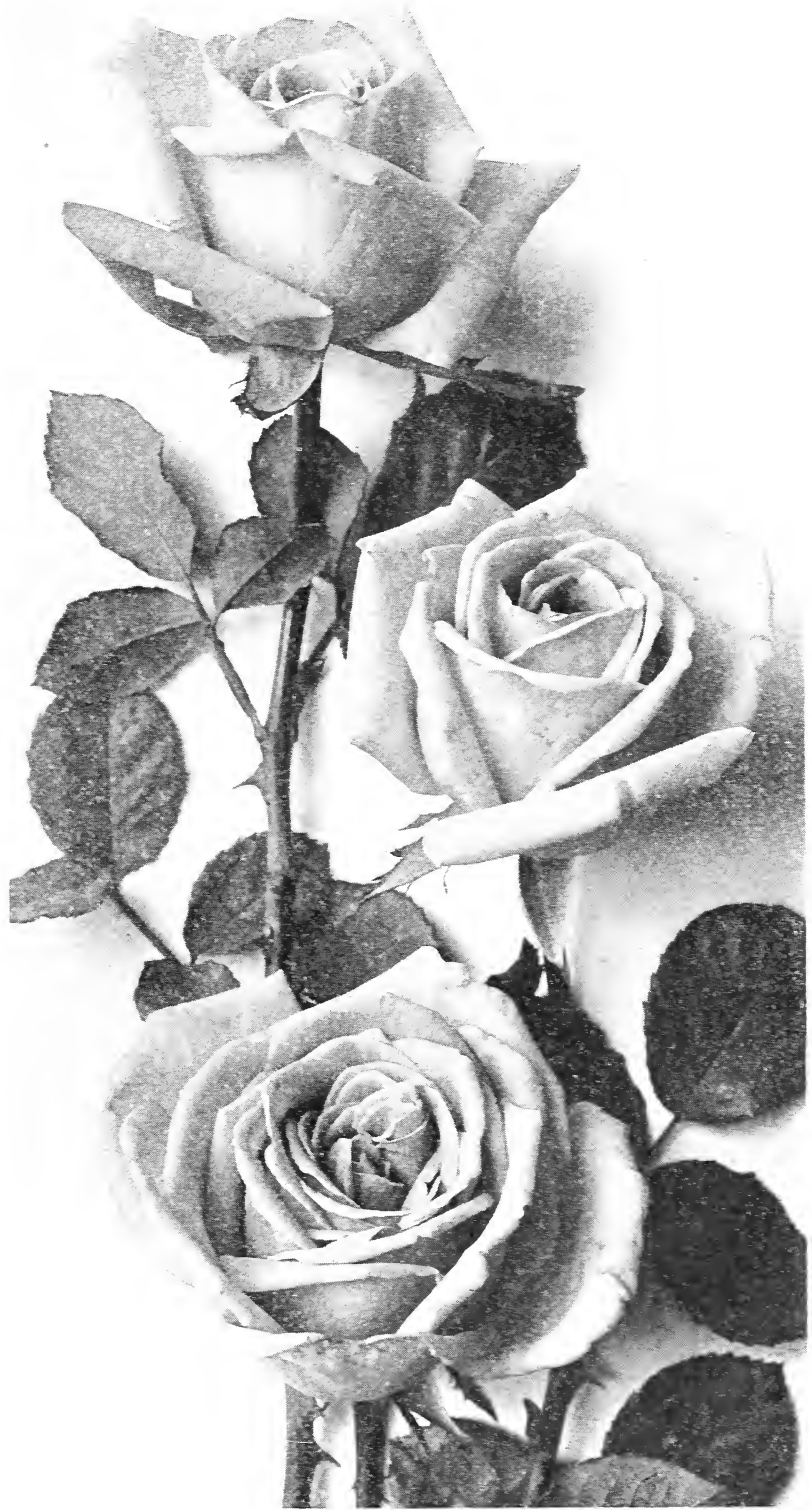
Dame Edith Helen

EMILE CHARLES. A recent French introduction with very highly colored buds and open flowers. The buds are a fiery red shade, with a suffusion of golden yellow. As the flowers develop the color changes to a superb coral red