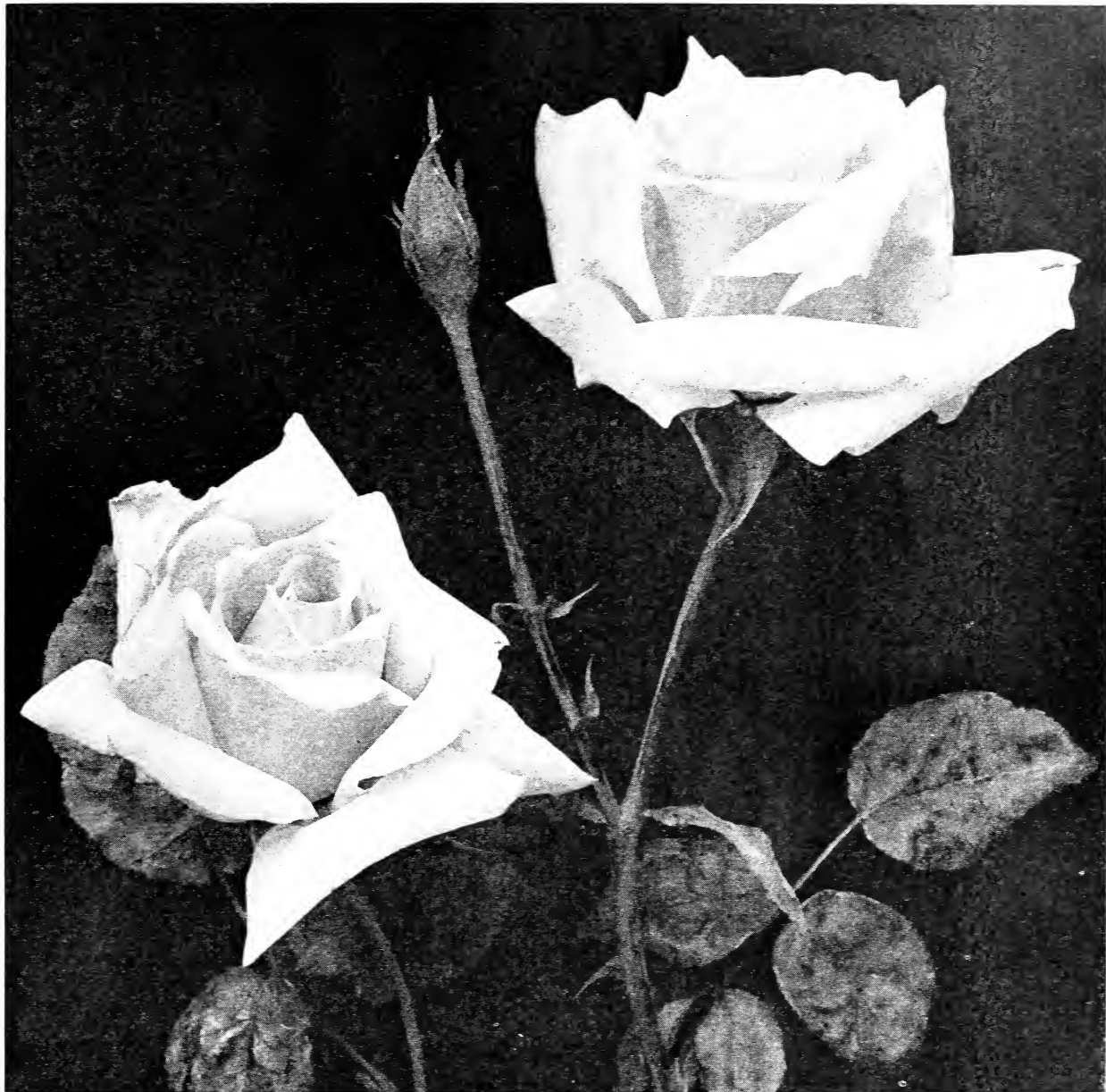
Mad. Jules Bouche

MRS. HENRY MORSE. A new rose of superlative merit; in our opinion a top notcher in roses of its particular color, the latter being a lovely shade of bright rose, with clear vermillion veinings on the petals. Perfect as to shape, magnificent as to form, either in the bud or open flower, with a freedom of blooming and habit of growth which cannot be excelled. Immense as to its size. Very fine. Price each $1.00