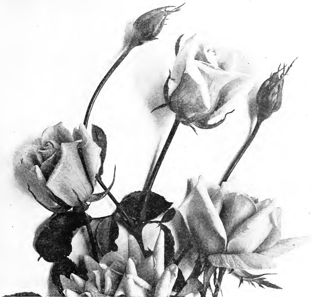
Mrs. W. C. Egan

WM. F. DREER (Howard & Smith, 1920). We regard this rose as one of the finest which has been our good fortune to produce and introduce to the rose-loving public. It is a rose which through sheer merit is today recognized as one of the leading novelties of recent introduction. It won the gold medal at the show of the National Scottish Rose Society, held in Edinburg, Scotland, and has been awarded numerous certificates and medals in many other parts of the world. In general form it is almost a counterpart of Los Angeles, with much the same habit of growth, freedom of bloom, shape of flower, etc., but differs entirely in color, it being a deep golden yellow, heavily flushed and shaded deep peach and old rose. Very brilliant and delightful combination of colors not seen in any other variety. A grand rose for cutting purposes. Price each $1.00.