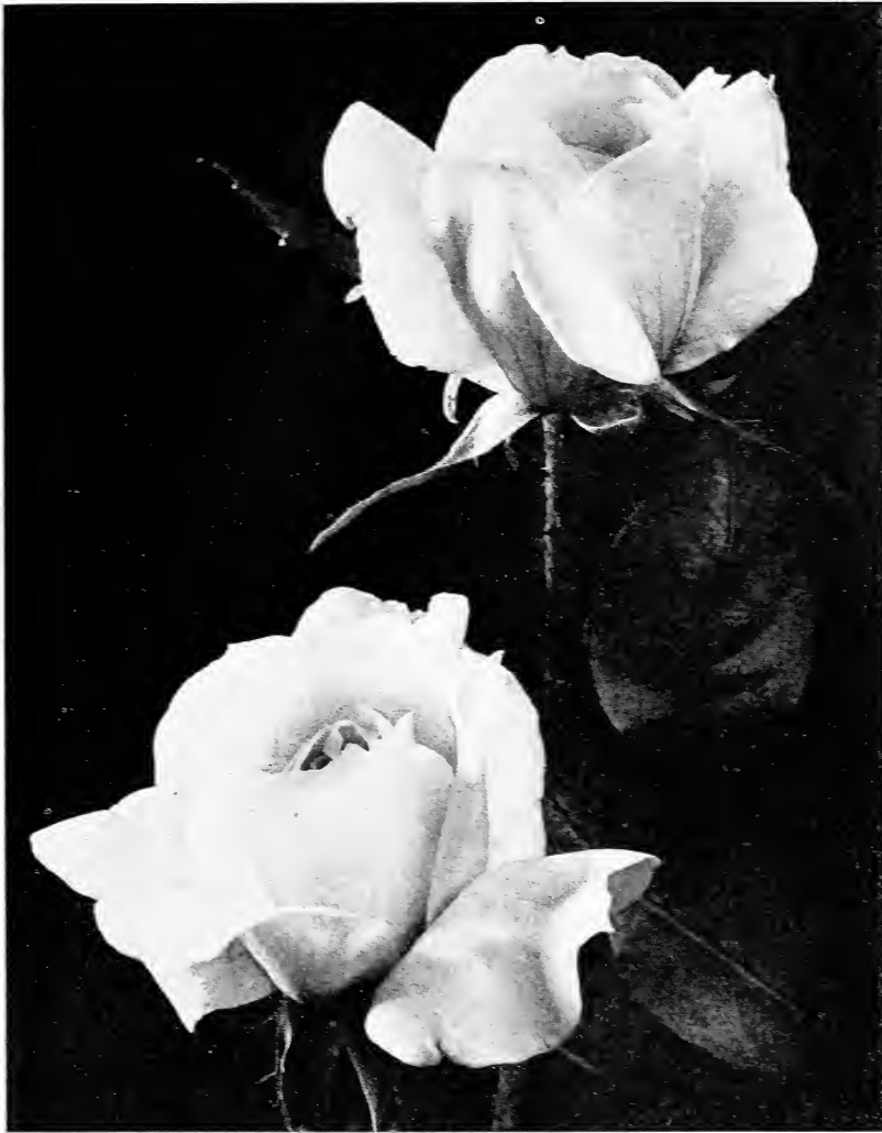
Mad. Albert Barbier

LADY FLORENCE STRONGE (McGredy). This is another of the new Irish roses and a splendid addition to our novelty sheet for the season of 1927. We quote the raiser's description: "The color is reddish prawn to violet old rose, shading at the base of the petals to yellow and towards the edge, to pink, the inner surface of the petals being heavily veined and slightly flushed scarlet. An indescribably beautiful combination of color." We can only add, it is a rose of splendid quality and one which is destined to grow in popular favor. The growth is free and bushy and the flowers are carried upright on stout stiff stems. Price each $1.50.