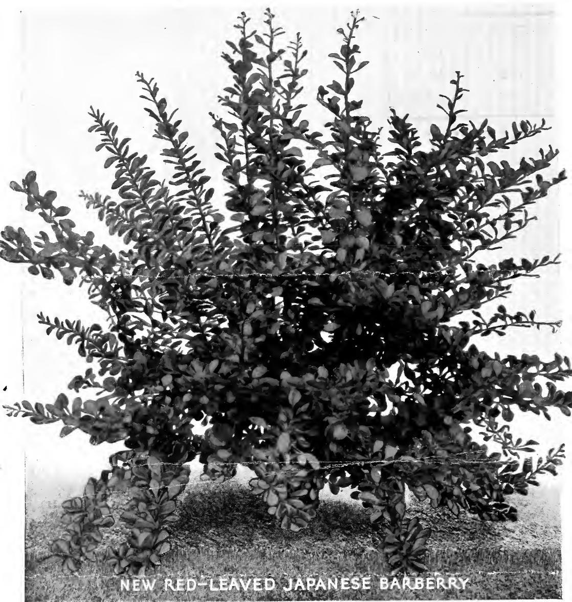
NEW RED-LEAVED JAPANESE BARBERRY

IT IS only once in a lifetime that a really worth-while, outstanding novelty in hardy shrubs is introduced, and in this new Barberrry we have such a plant.