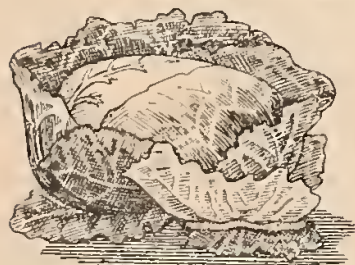
Early Flat Dutch

This variety needs no recommendation, as it is one of the oldest in cultivation. Exceedingly valuable for its quality, and for its ability to resist heat. Heads very solid, round, flattened on top, tender and fine grained.