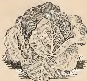
Early Jersey Wakefield

Many market gardeners consider this the best cabbage in cultivation. Its merits are many, among which are large heads for an early variety, small outside foliage, and uniformity of crop. The heads are medium size, cone shaped, and are white, solid and tender.