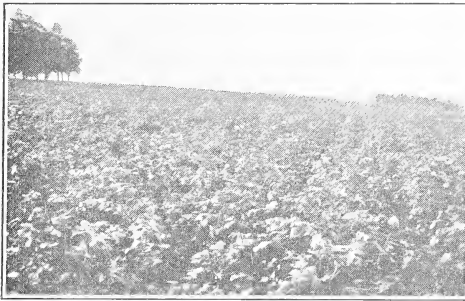
The Crop Will Look Like This

The best of seed potatoes can be ruined in storage. Results have proved our storage methods right. Temperature and ventilation are so controlled as to retard sprouting and give us the firm, plump seed at shipping time, so necessary for a perfect stand of vigorous plants.