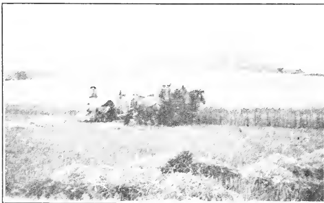
Good Seed Makes This Possible

You can save yourself considerable trouble and delay in the busy planting time by ordering these all cleaned, mixed, bagged, ready to dump in the drill and sow. Order oats and barley mixture if your conditions are not right for the peas. If they are right then by all means use the peas too. See price list and order sheet enclosed.