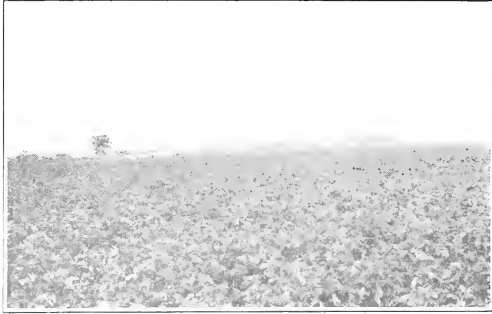
Vines Like These Yield Over 300 Bushels

The Russet is a money maker. We bank on it for the main crop and recommend it to you. It won't fail you if you do your part.