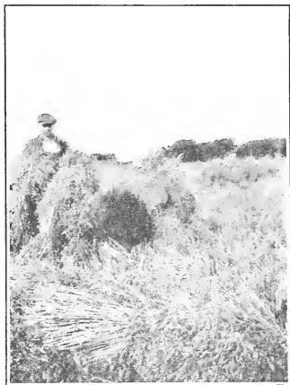
Money Making Cornellian Oats

Only one other oat is considered to have a stronger straw than Cornellian, that one being Upright. Except on very rich land, however, Cornellian usually stands as well as Upright and better than most oats.