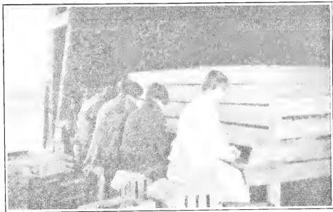
Cutting Seed—Carefully Easily

Dry rot is one cause of poor stands. It is from dry rotted seed also that blight infection will start again this year. Treating seed will not prevent it. After it starts, blight can spread thru the air from plant to plant and from field to field. There is great danger of another serious outbreak of late blight this season. Clean seed will prevent primary infection of one's crop and thoro bordeaux spraying or dusting will prevent infection from other fields.