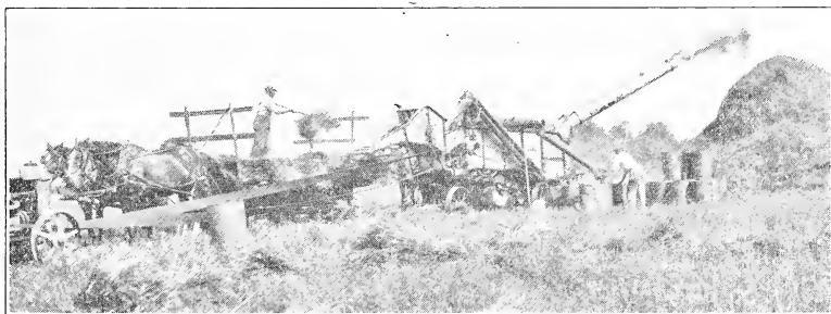
Threshing Our Own To Protect Our Seed

One lot is a small seeded light green pea, testing 99.7% pure, no weed seeds and 97% germination. The other is a small seeded cream colored pea testing 99.5% pure, no weed seeds and 98% germination. We offer them as Quaker Hill Selected Field Peas, confident that our painstaking precautions will benefit you. These peas have cost us at carload rates more than unknown and untested seed is retailing for. We are selling them at just enough to cover handling and overhead costs. You can buy cheaper pea seed, but the chances are 3 to 1 that you will be wasting your money. Better use tested disease-free seed or not any. Our supply is limited. See price list and order sheet enclosed.