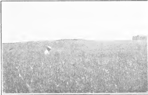
Inspecting Upright Oats

No mustard and no smut were found in these fields.