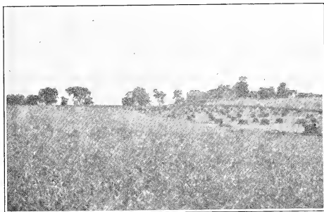
Wheat Harvest at Quaker Hill

This strain, originated by the plant breeders at the N. Y. State College of Agriculture, was developed from a beardless head of Fulcaster wheat. It is like this variety except that the beardless character is retained and it out-yields the parent stock. The large heads have white chaff and are carried on good stout straw. The grain is large, red and somewhat hard. It has a high protein content, testing as high as 13%. Milling and baking qualities are the best. This strain has proven winter hardy and immune to loose smut.