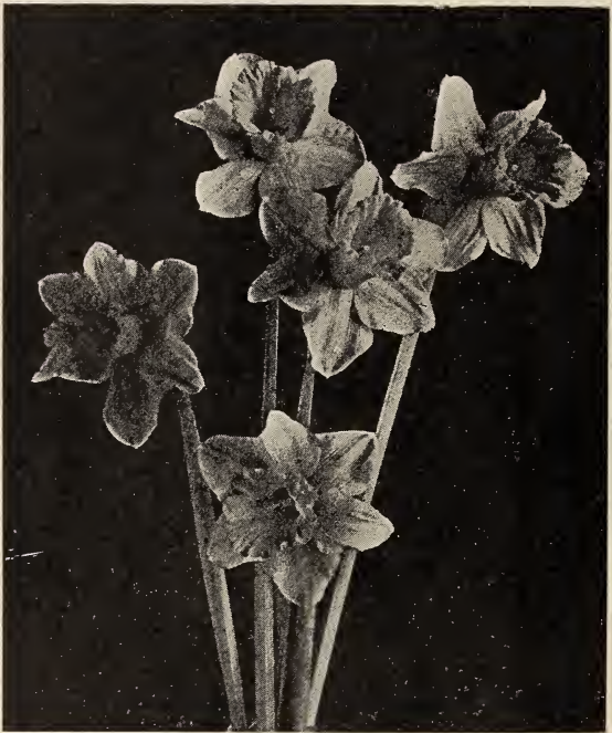
Single Narcissus—Sir Watkin

Chinese Sacred Lily. White with yellow cup. Large bulbs. Each, 20c; doz., $2.00.