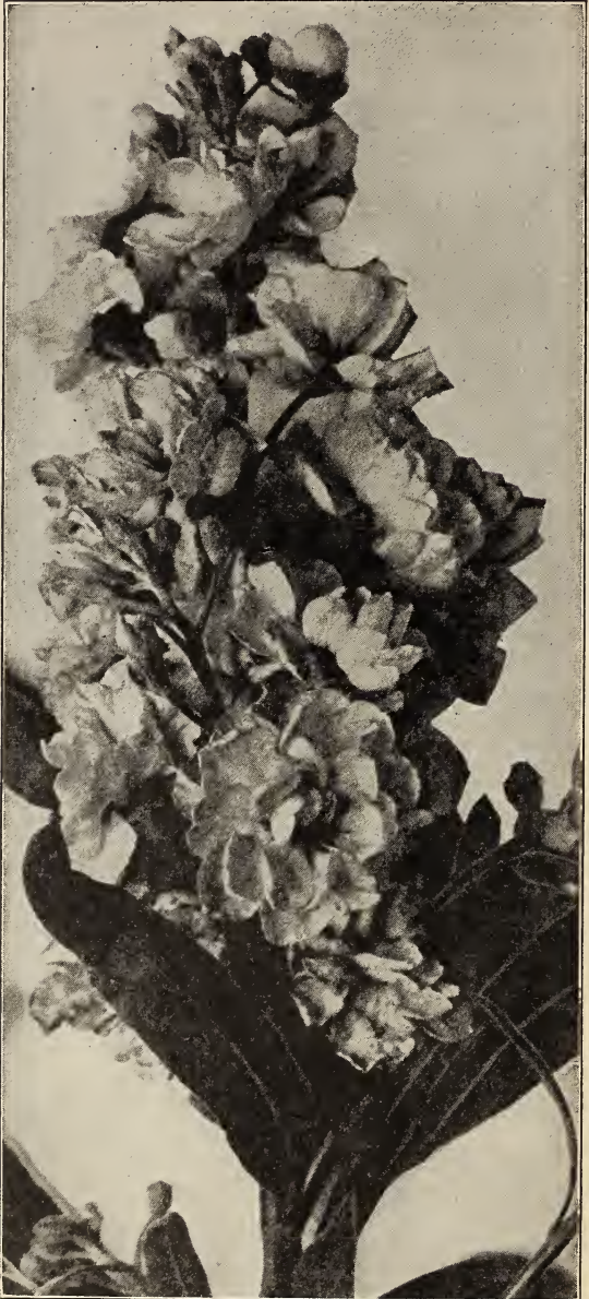
Nice Giant Stocks