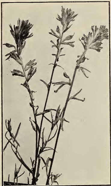
Castilleja californica —"Indian Paint Brush"

Floerkea douglasii . "Meadow Foam." Annual, of low spreading habit; flowers cream-colored. Prefers a moist location. Pkt., 10c; oz., 50c.