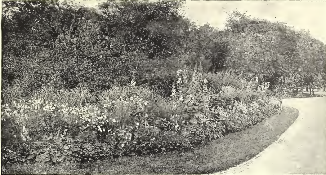
An enjoyable Hardy Perennial Border along driveway