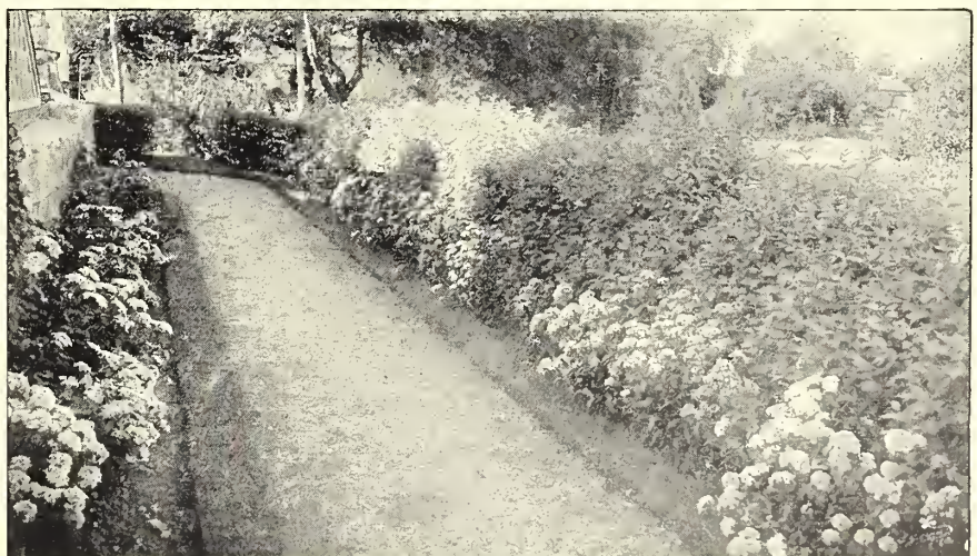
Perennial Border. Sweet William in the foreground

"But now that the treasures of the Far East are lavished upon us, we have hardy plants suitable for practically every purpose the most exacting gardener can conceive. And wherever we have any special object to accomplish, we ought to try nine times to find a hardy plant that will do the work, before falling back on a tender one. And this for two reasons: First, hardy plants harmonize better with our climate and environment than tropical plants. Second, as a rule, they are cheaper to maintain. And, in the long run, those effects which grow naturally out of the soil, and out of true economy, will be recognized as the most artistic."