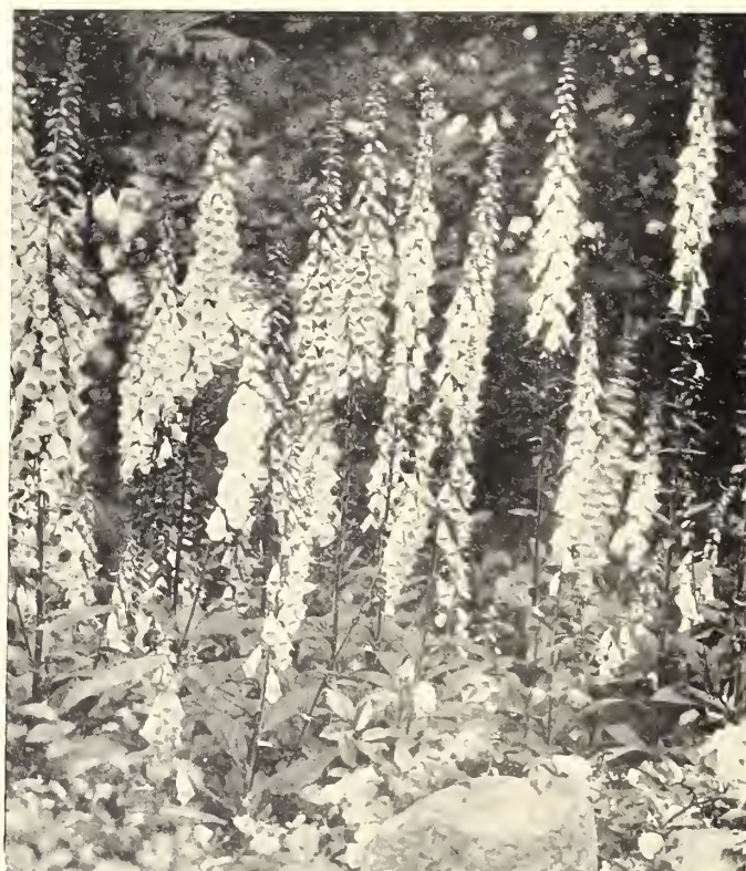
Digitalis, or Foxglove