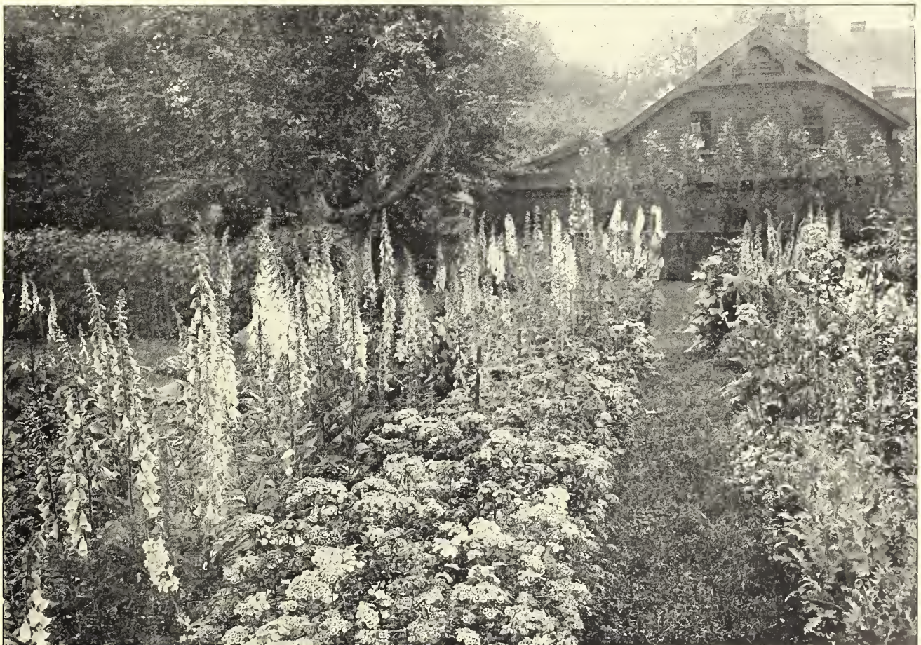
A border of Hardy Perennials. Foxgloves, Larkspurs and Sweet Williams the chief features

Price for entire collection, boxed and delivered to destination, $21