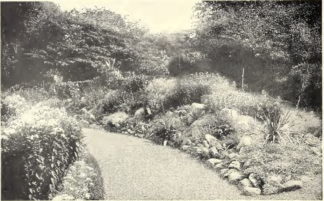
SHOWING LUXURIOUS RAMBLING ROCK-GARDEN EFFECTS PRODUCED BY PERENNIALS AND ROCK-GARDEN PLANTS