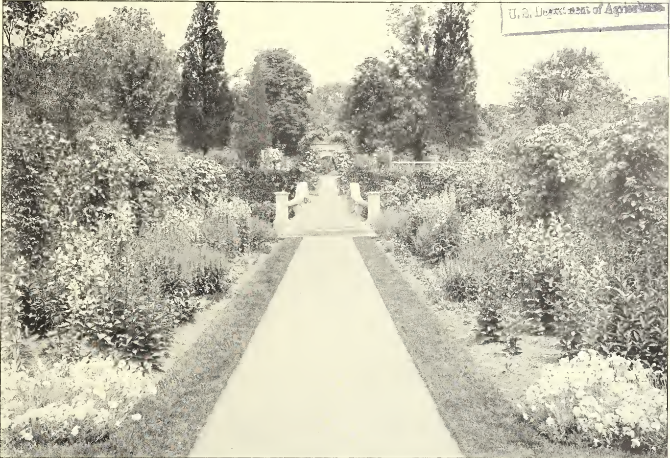
In a beautiful Hardy Garden is where the peace and quiet that passeth all understanding can be found

LIBRARY RECEIVED ★ JUN 1 1931 ★ U. S. Department of Agriculture