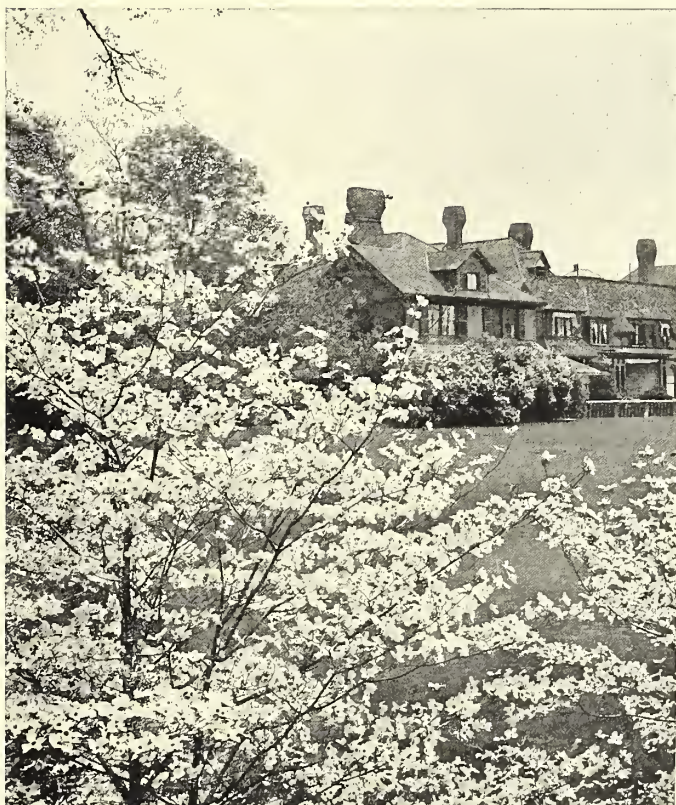
Flowering Dogwood Tree

Price for entire collection, boxed and shipped to destination, $32