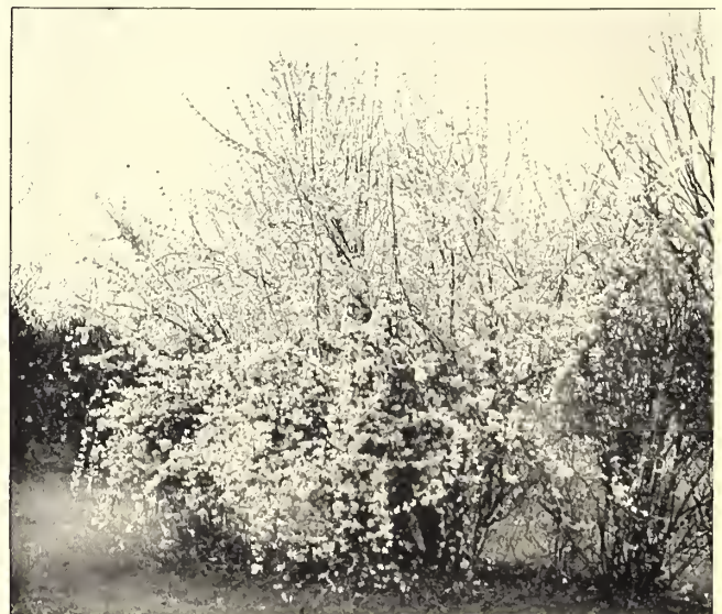
Forsythia in early spring