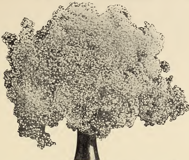
GYP SOPHILA PANICULATA DOUBLE "SNOW WHITE"