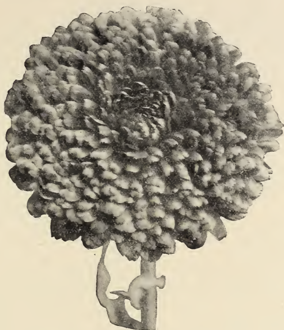
CALENDULA "ORANGE KING IMPROVED"