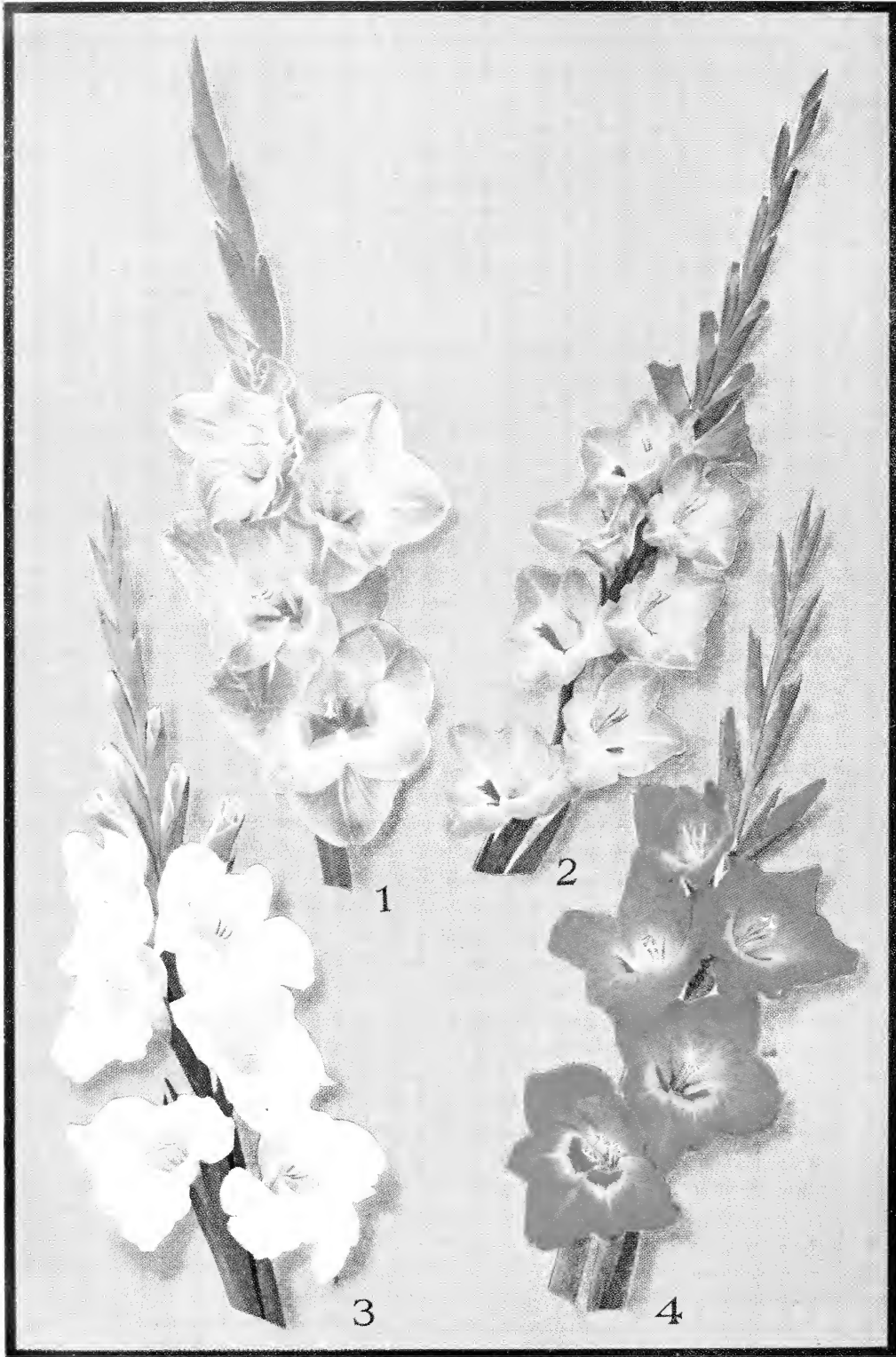
1. Glory of Kennemerland 3. Maine (8)