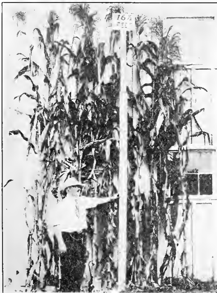
Wood's Pamunkey Ensilage Corn