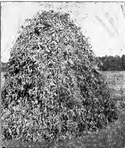
The Pine Dell Perfection Soja Bean as a hay bean. Yields from 2½ to 4 tons per acre of superior hay as compared to Alfalfa.

When planting the Pine Dell Perfection Soy Bean for hay, 24 to 26 quarts of seeds per acre is sufficient for good results on account of the plant having a large amount of laterals. Only one-half bushel per acre is needed when raising the beans for seed. This bean is of medium size and has a distinctive color, and cannot be confused with other varieties.