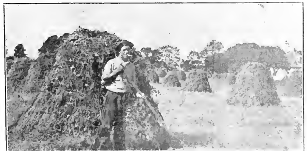
The Pine Dell Perfection Soja Beans in shocks. Yield last year on Jamestown Island 2½ tons per acre, in spite of seven weeks drought.