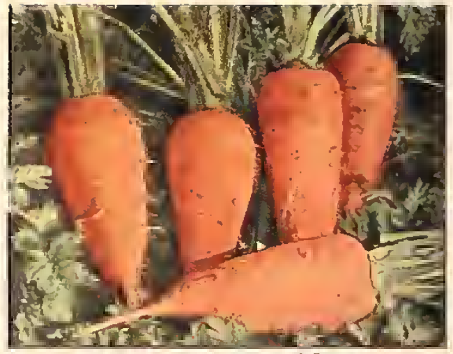
Chantenay or Stump-rooted Carrots