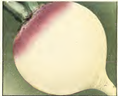
Purple-top White Globe Turnip

The cost is only $11 for the complete group of 124 plants and trees.