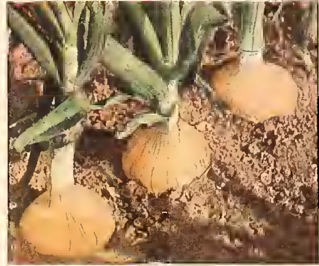
Barnard's Prizetaker Onions

Red Bottom Sets. Lb. 30 cts.; \frac{1}{2} lb. 15 cts.