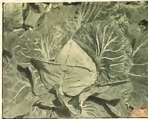
Early Jersey Wakefield Cabbage