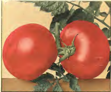
Bonny Best Tomatoes

NITRATE OF SODA acts quickly on lettuce, cabbage, and similar plants. Apply in liquid form—1 ounce to 2 gallons of water. 2 lbs. 30 cts.