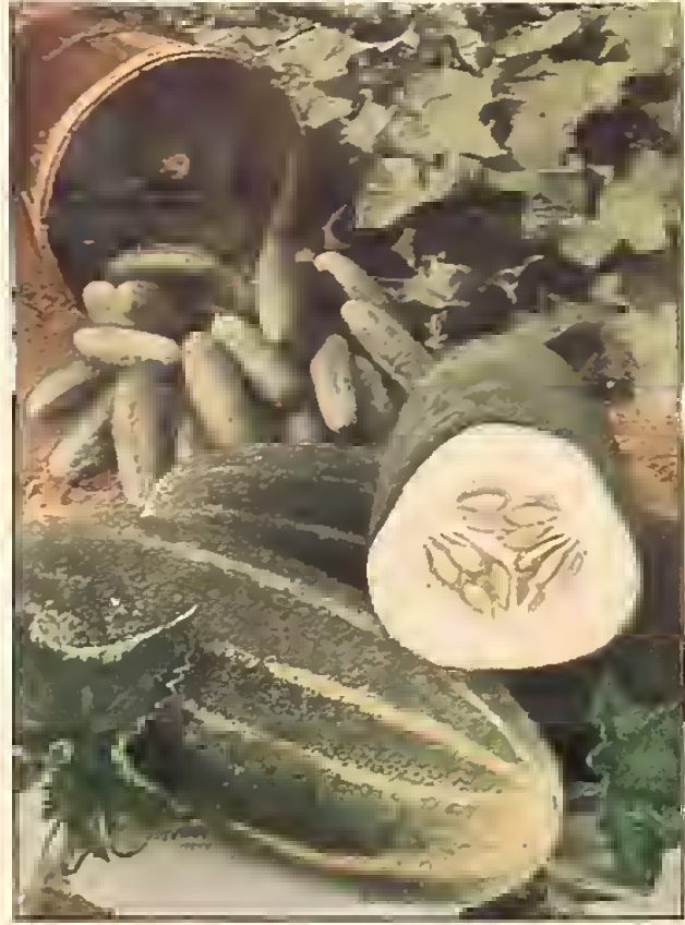
Early Fortune Cucumbers

Chicago Pickling. Color, shape, quality, and productiveness make this the chief variety for pickling purposes. \frac{1}{4} lb. 40 cts.; oz. 15 cts.; pkt. 10 cts.