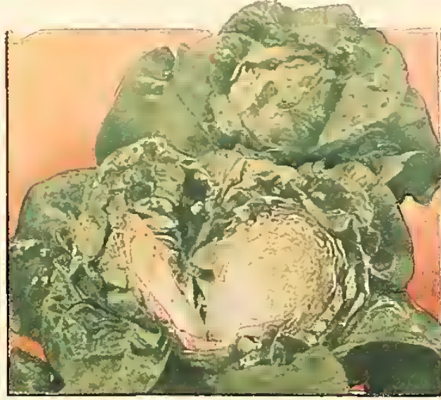
Big Boston Lettuce

Trianon Cos. Long, spoon-shaped foliage. Plants should stand about 6 inches apart, with the outer foliage drawn together and tied so as to blanch the inner leaves. \frac{1}{4} lb. 60 cts.; oz. 25 cts.; pkt. 10 cts.