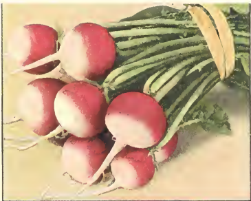
Scarlet Turnip White-tipped Radishes

Champion Moss Curled. Parsley is slow to germinate. Soak the seed in luke-warm water for an hour or more, then sow about half an inch deep. Thin the plants to about 4 inches apart. This is a new variety with curled and crimped leaves, used chiefly for garnishing. Oz. 20 cts.; pkt. 10 cts.