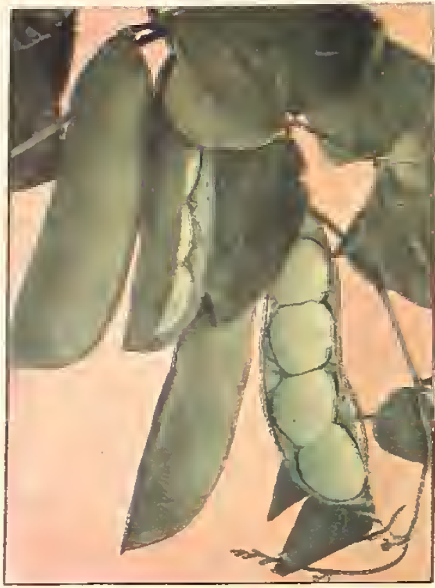
Burpee's Bush Lima Beans