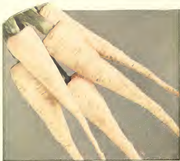
Hollow Crown Parsnips