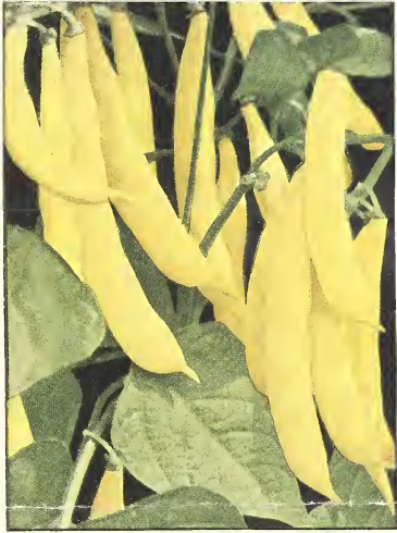
Improved Golden Wax Beans

Fordhook. An excellent Bush Lima for the home-garden. Lb. 50 cts.; carton 20 cts.; pkt. 10 cts.