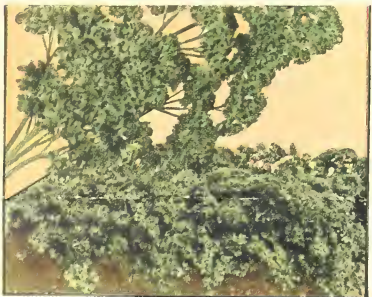
Champion Moss Curled Parsley

Hollow Crown. The old-time standard variety for market-garden or for home-growing. None of the later sorts can take the place of this variety. \frac{3}{4} lb. 35 cts.; oz. 15 cts.; pkt. 10 cts.