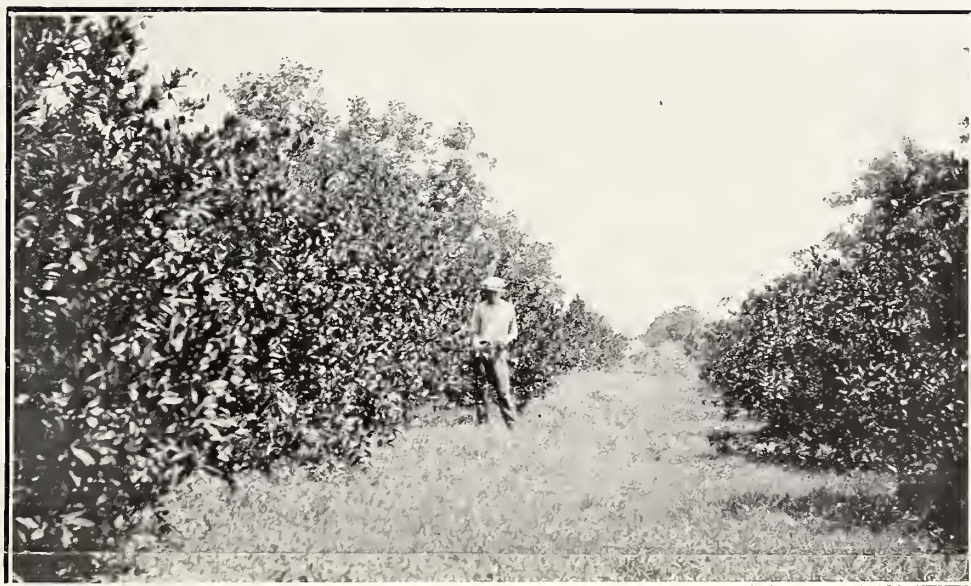
11 year old Satsuma Orchard, Carol Plantations

Carol Plantation Nurseries have been maintained for the purpose of supplying the needs of our own orchards as well as supplying other planters. Our budwood has been carefully selected from trees known to be bearing first-class fruit or nuts. Our confidence in the Satsuma and Pecan industries and in our nursery stock is indicated by the fact that we have planted nearly 126,000 Satsuma trees and over 14,000 Pecan trees. We have a right to your confidence when we thus demonstrate our faith in the future. We are not advising you to follow a course or engage in an undertaking we do not adopt ourselves.