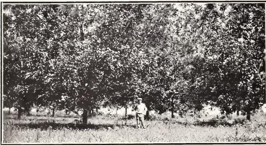
11 Year Old Pecan Orchard at Carol Plantations