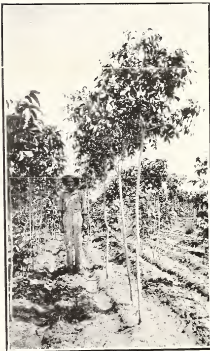
Pecan Trees in Nursery, Carol Plantations

Pecan trees begin to bear nuts about the fourth year and will bear about 10 pounds per tree at 8 or 9 years. As the Papershell Pecan tree planted in orchards has a record of only about 25 years, it is impossible to say what yield will ultimately be obtained. An 18-year-old tree in the vicinity of the Carol Plantation has borne from 100 to 150 pounds. A 25-year-old tree at Ocean Springs has borne over 300 pounds in one season. Native Pecan trees live to be hundreds of years old.