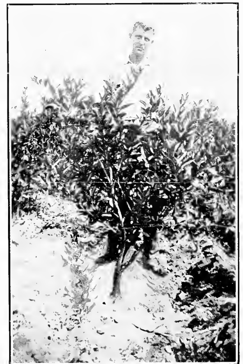
Satsuma Trees in Nursery, Carol Plantations