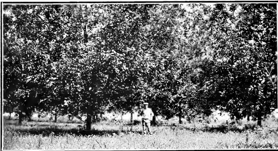
11 Year Old Pecan Orchard at Carol Plantations