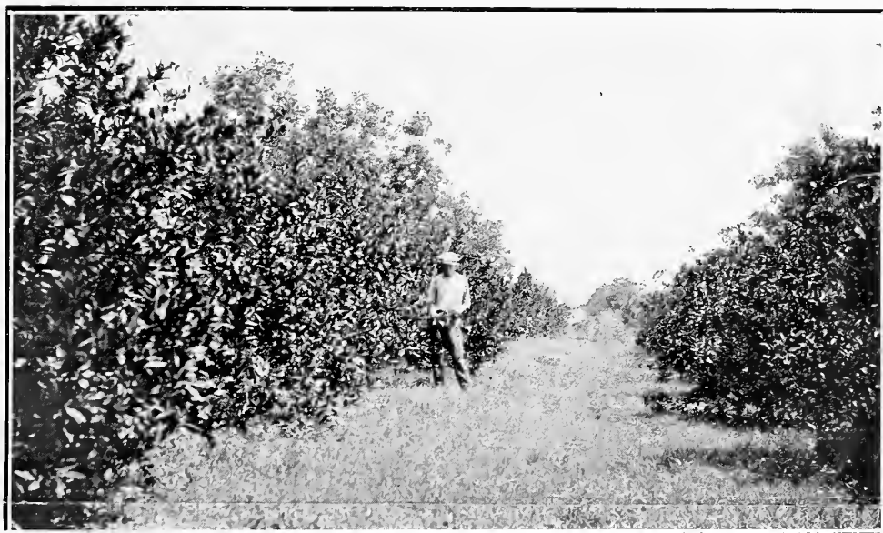
11 year old Satsuma Orchard, Carol Plantations

Carol Plantation Nurseries have been maintained for the purpose of supplying the needs of our own orchards as well as supplying other planters. Our budwood has been carefully selected from trees known to be bearing first-class fruit or nuts. Our confidence in the Satsuma and Pecan industries and in our nursery stock is indicated by the fact that we have planted nearly 126,000 Satsuma trees and over 14,000 Pecan trees. We have a right to your confidence when we thus demonstrate our faith in the future. We are not advising you to follow a course or engage in an undertaking we do not adopt ourselves.