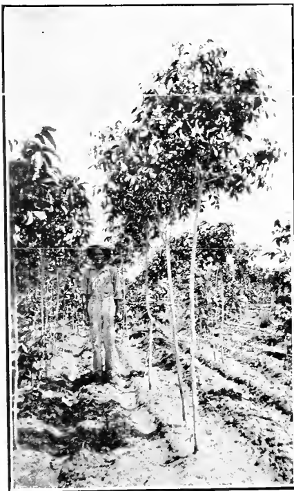
Pecan Trees in Nursery, Carol Plantations

Pecan trees begin to bear nuts about the fourth year and will bear about 10 pounds per tree at 8 or 9 years. As the Papershell Pecan tree planted in orchards has a record of only about 25 years, it is impossible to say what yield will ultimately be obtained. An 18-year-old tree in the vicinity of the Carol Plantation has borne from 100 to 150 pounds. A 25-year-old tree at Ocean Springs has borne over 300 pounds in one season. Native Pecan trees live to be hundreds of years old.