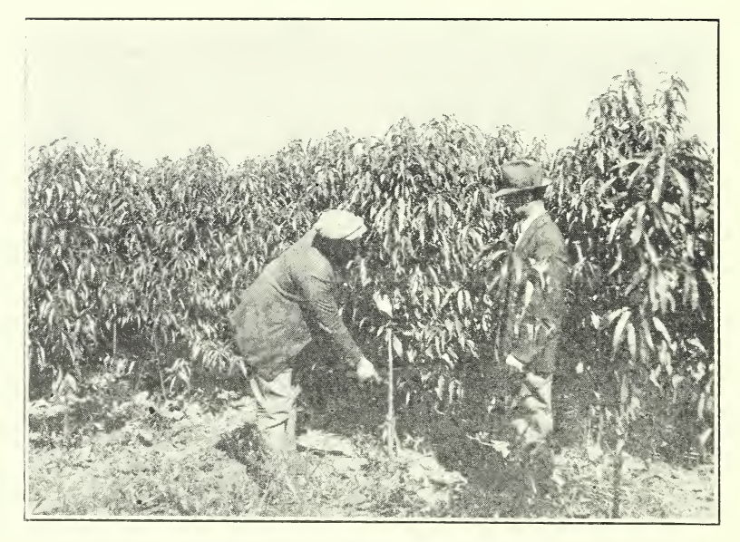
BLOCK OF 1 YEAR PEACH TREES