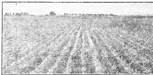
A field of our Famous Bermuda Onion Plants. Aren't they nice ones?

FARMERS AND GARDNERS —In making up our prices on our Bermuda Onion plants we have put them within reach of all. We are prepared to take care of all small orders with the same degree of satisfaction and quick service as on larger orders and assure you that all orders will be appreciated, large or small as they may be, so if you only want a few plants for your own use, do not hesitate in mailing us your order.