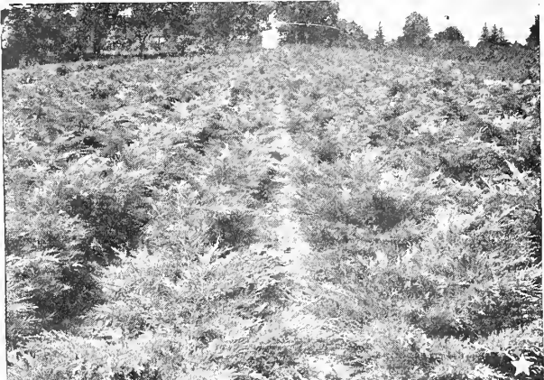
Juniperus pfitzeriana, 1 1/2 ft. to 2 ft.