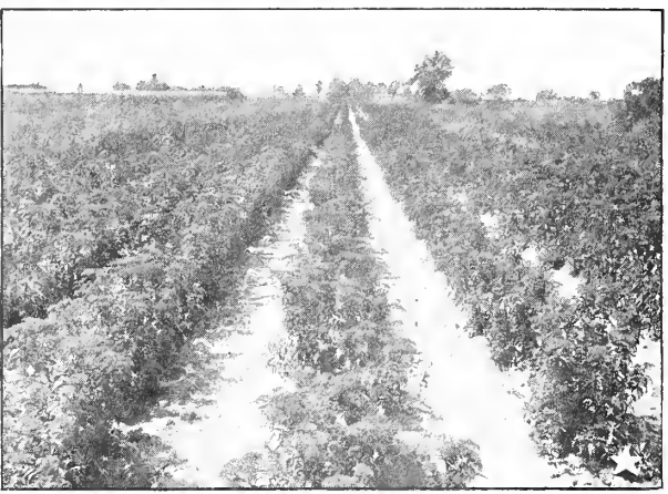
Plan now for solid rows like these!