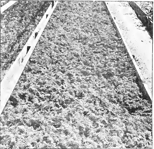
Potted Evergreens being finished off in coldframes.