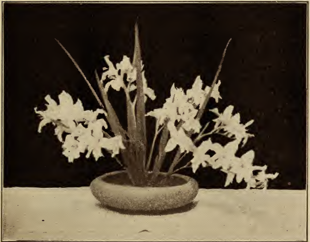
Gladiolus Peach Blossom

Blooms in June. Unlike the summer “glads.” Must be planted in the fall. Sprays of graceful blooms unsurpassed in beauty. Splendid for either outside or indoor growing.