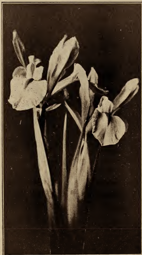
Dutch Iris "Adrian Backer"