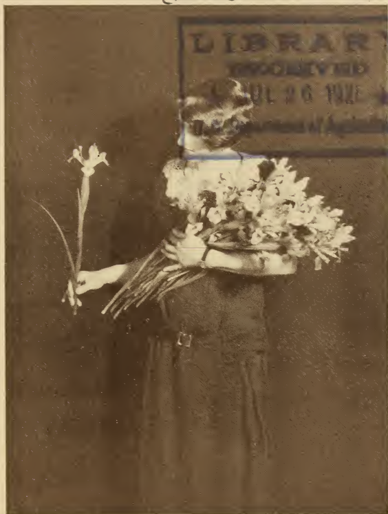
The Beautiful Dutch Iris