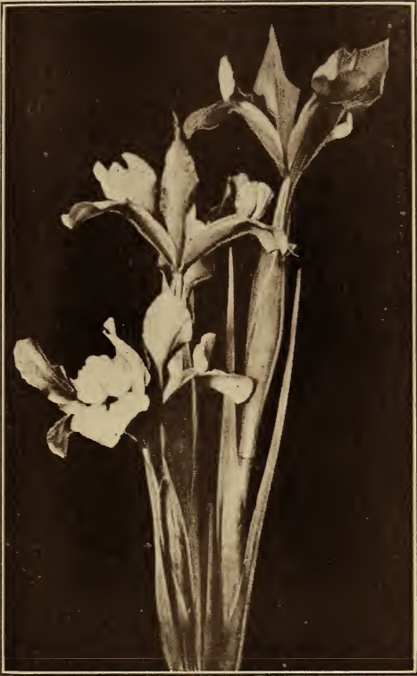
Dutch Iris "Imperator"