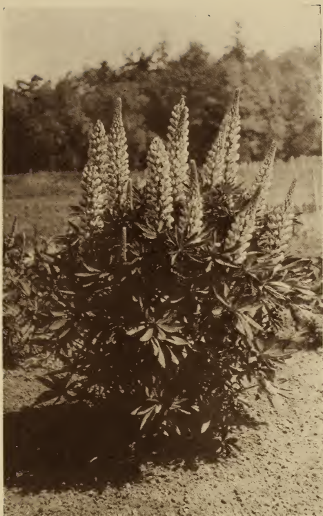
Lupin "Belle of Bellevue"