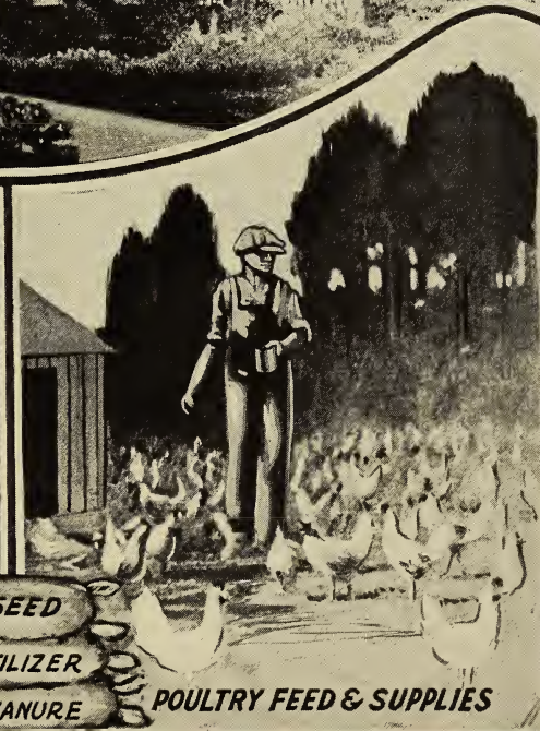
POULTRY FEED & SUPPLIES