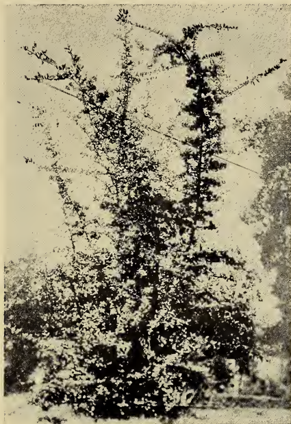
PYRACANTHA COCCINEA LALANDI

RHODODENDRONS are the most magnificent of all evergreen shrubs. Their large trusses of brilliantly colored flowers are unsurpassed in beauty. Like many other desirable things, they are not the easiest to be had; for the rhododendron is particular about the conditions under which it will grow. It prefers the moist air of the mountains which we cannot duplicate here, but it will grow well for us if we provide everything else it wants; partial shade, an acid soil rich in leaf-mould and humus and free from lime; moisture at all times, but good drainage; and a very heavy mulch of leaves or peat moss, which is best. Acidity of soil may be produced by sprinkling aluminum sulphate on the ground. The roots are close to the top of the ground and must not be disturbed by hoeing.