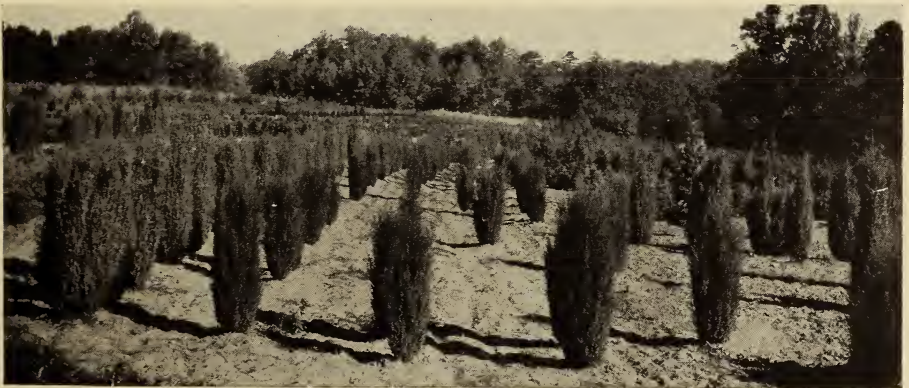
FIELD OF JUNIPERS GROWING ON OUR NURSERY