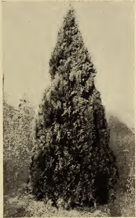
THUYA ORIENTALIS AUREA CONSPICUA

THUYA OCCIDENTALIS WOODWARDII (Woodward's Globe). A more compact and perfect shape than Globosa .