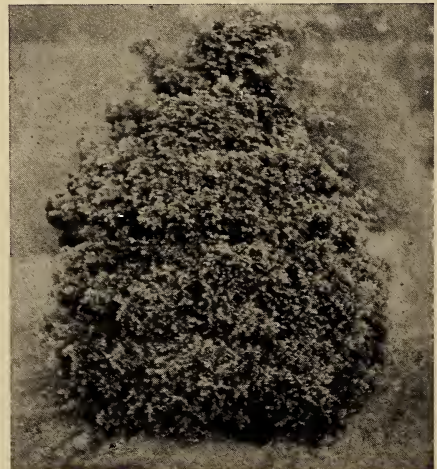
RETINOSPORA PLUMOSA SQUARROSA VEITCHI

RETINOSPORA FILIFERA AUREA. Same as above but golden, very beautiful.