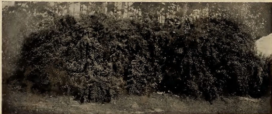
GROUP OF SPIREA THUNBERGII

VIBURNUM PLICATUM (Japanese Snowball). This plant has an upright bushy growth and very pretty foliage. The flowers come in large round white heads.