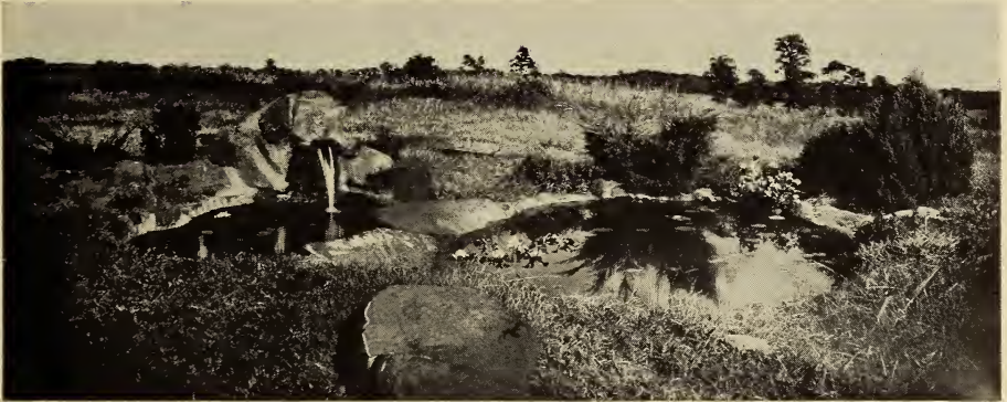
ARTIFICIAL LILY POOL, WATER FALL AND ROCK GARDEN