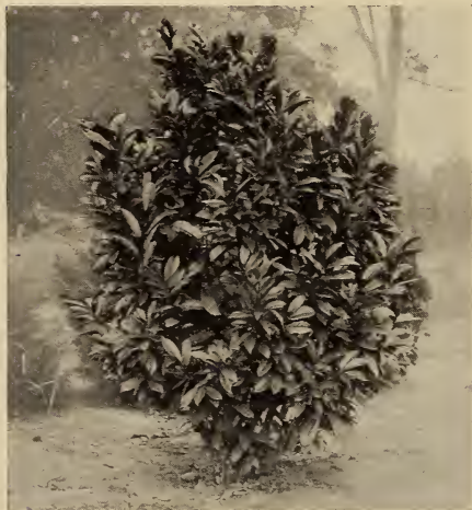
LAUROCERASUS OFFICIALIS (English Laurel)

NADINA DOMESTICA. The flowers are white followed by bright red berries which persist all