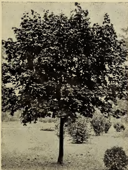
NORWAY MAPLE ( Acer Platanoides )

Shade trees are always an attractive setting for the home. They are necessary, too, to add cool comfort to the hot summer days. As an investment, they always add considerably to the renting or selling value of a place. It is the trees and flowers around the house that give it environment and atmosphere and make it home. Trees do not wear out like other things; they constantly increase in value. There's a tree at your house, tied to old memories, that you wouldn't part with; plant others; your children will be glad of those old memories later.