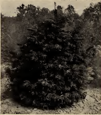
ABIES CONCOLOR (White Fir)