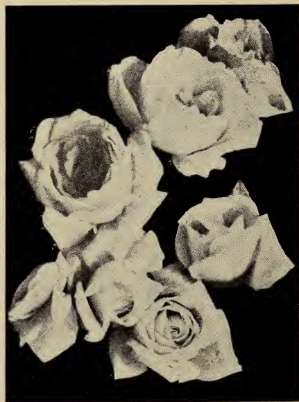
ALEXANDER HILL GRAY

CL. SUNBURST (C. H. T.) An exact counterpart of the bush form but a very vigorous grower.