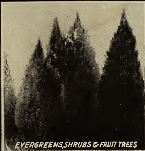
EVERGREENS, SHRUBS & FRUIT TREES