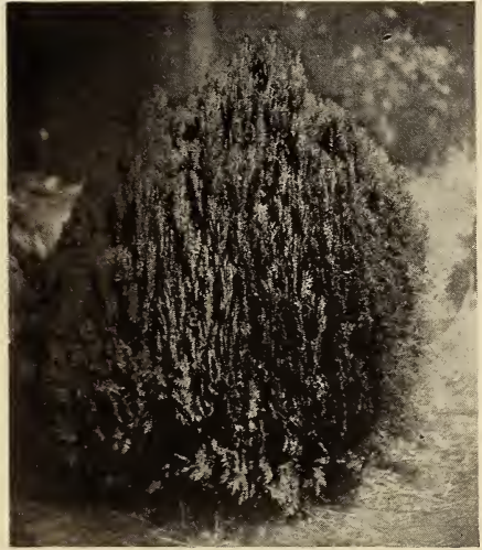
BIOTA AUREA NANA