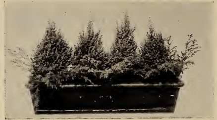
BOX PLANTING OF CONIFEROUS EVERGREENS

through winter. Foliage deep green turning red. A very attractive plant.