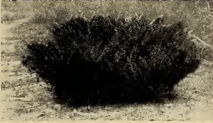
JUNIPERUS COMMUNIS DEPRESSA