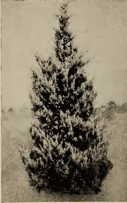
JUNIPERUS VIRGINIANA GLAUCA

JUNIPERUS CHINENSIS COLUMNARIS (Blue). A new variety introduced by the Department of Agriculture. In habit of growth it resembles the well known Italian Cypress, is perfectly hardy and retains its color effect in the winter.