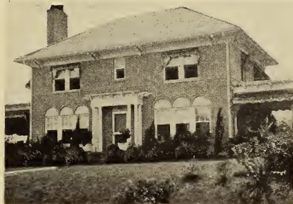
"IT'S NOT A HOME 'TIL IT'S PLANTED"

White waxy berries, does well in poor sandy soil, almost an evergreen.