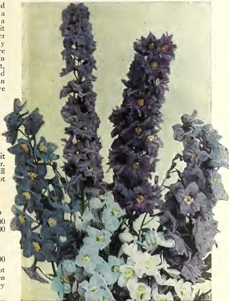
Selected Hybrid Delphiniums

Delphinium Guarantee. Anyone who is not entirely satisfied with Farr Delphiniums when received and when they bloom can receive money back without question.