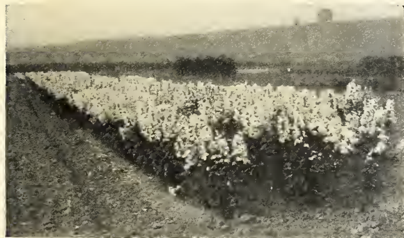
Field of Miss Lingard Phlox at Weiser Park