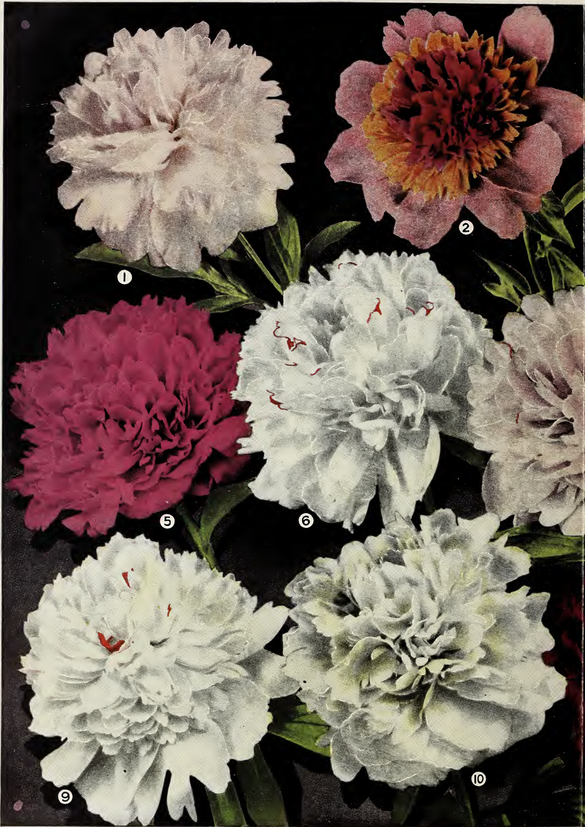
1 Sarah Bernhardt 2 Golden Harvest 3 Couronne d'Or 4 Officialis Rubra 5 Nobilissima 6 Festiva Maxima (Size of flowers mm)