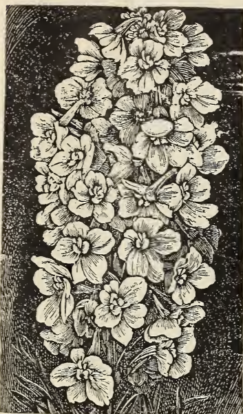
Everblooming Hardy Larkspur

VAN DER BILT, HYBRIDS (Perennial)—This is the freest and most continuous blooming Hardy Larkspur.