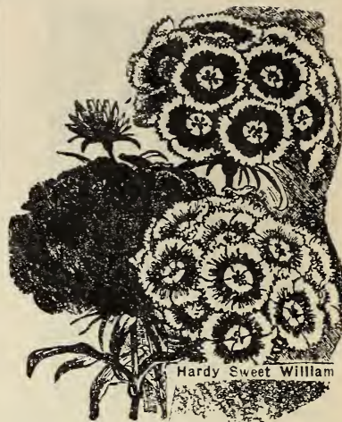
Hardy Sweet William

Flowers are very large and fragrant. Each, 30c; doz., $2.50. Spring plants, 3 for 20c; doz., 60c.