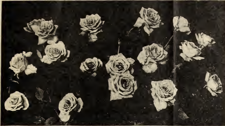
Frau Karl Druschki

The Cream of American Grown Roses for the Pacific Northwest