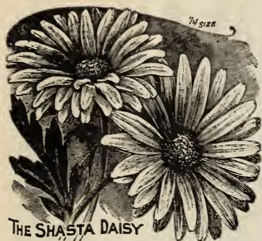
THE SHASTA DAISY

A much improved hardy daisy, bearing a profusion of large, white flowers from early summer until late in the fall. Fine for cut flowers. Each 30c; per doz. $3.00 Spring plants, 3 for 20c; doz., 60c; 100, $4.00.