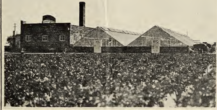
Partial View of Service Plant and Green Houses