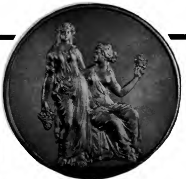
Achievement Medal, 1924. Won by Kunderd Gladioli.