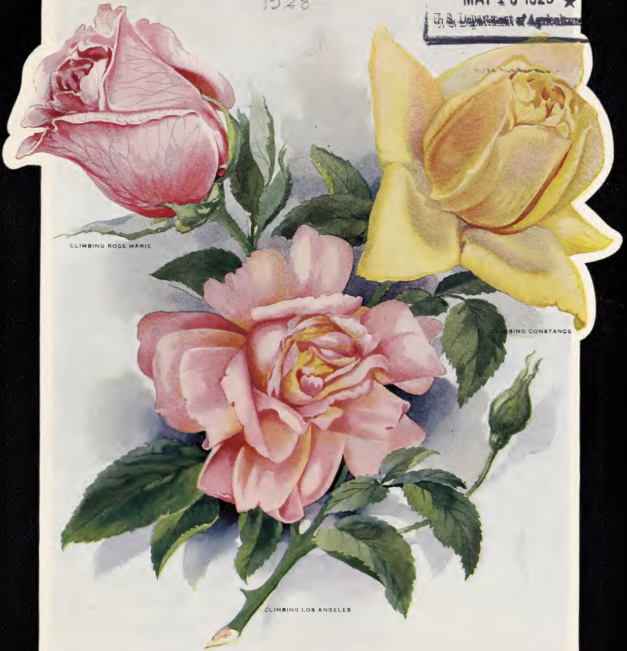
CLIMBING ROSE MARIE