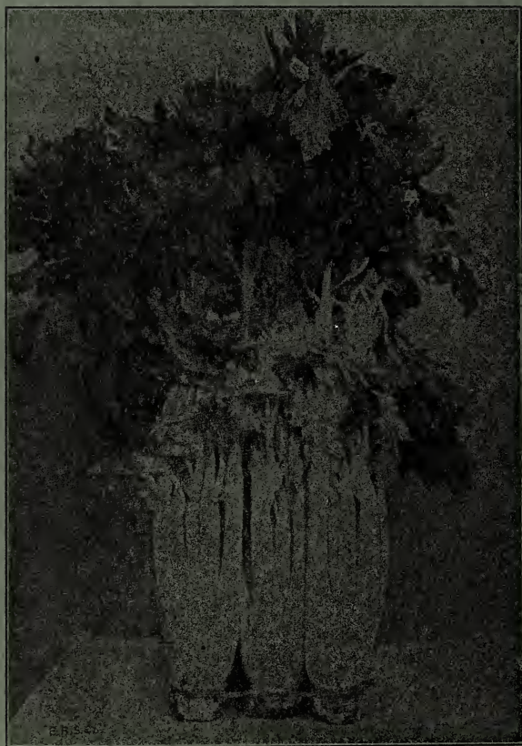
CELERY—New Golden Self-Blanching

Plan Next Season's Garden and Order Seeds Early