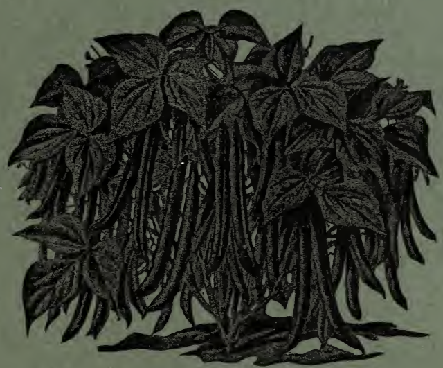
BEANS, GOLDEN WAX