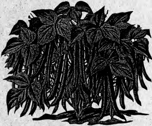
BEANS, GOLDEN WAX