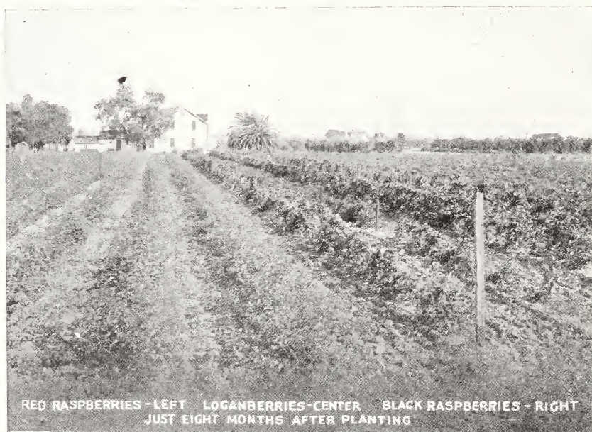
RED RASPBERRIES - LEFT LOGANBERRIES - CENTER BLACK RASPBERRIES - RIGHT JUST EIGHT MONTHS AFTER PLANTING

ent varieties of berries. The University of California at Berkeley, and also the Department of Agriculture at Washington, issue a number of circulars and bulletins on growing the different varieties of berries which will be mailed to you absolutely free if you will ask for them. These give a great deal of detailed information which is illustrated with pictures, making them very easy to read.