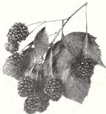
One Branch of Macatawa Blackberries

Macatawa Everbearing —The Macatawa is a bush type blackberry requiring no support. The fruit is uniformly large, very sweet, firm, with few seeds and practically no core. It bears an exceedingly heavy crop thru June and July, and another light crop of very large berries in the Fall. One grower reports a yield of 20,000 baskets to the acre from two-year-old bushes. Three years ago from a one-acre planting of one-year-old bushes we took 9000 12-oz. baskets. The same acre, the past two seasons produced 16,000 baskets annually, and the quality was so good that these berries sold for a premium. We consider this a very satisfactory showing for any variety of blackberry. The Macatawa is the practical sort for home garden planting, as it is both a good canner and fine for eating fresh. As a market