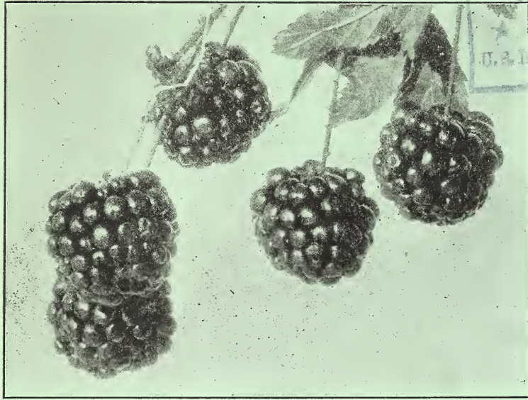
Advance Blackberry Photographed April 16th, [four weeks ahead of other varieties

RECEIVED MAY 15 1928 U. S. Department of Agriculture