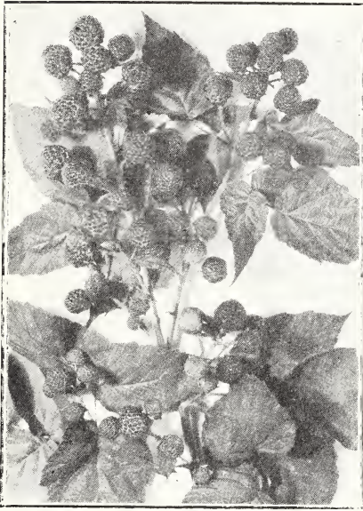
The Cumberland Black Raspberry

Nearly all varieties of the raspberry do well in the irrigated sections of the Southwest where soil and climate are adapted to their needs. Under careful management they produce large crops and return handsome profits to the grower.