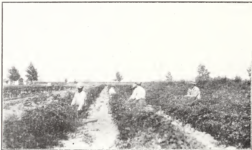
Picking Berries in one of our Gardena Dewberry Fields.

Gardena —This is the earliest and one of the most prolific of all dewberries, ripening four weeks later than the Advance blackberry, but two weeks earlier than the common varieties of blackberries. We consider the Gardena to be one of the best dewberries for planting in Southern and Central California, where it is unusually prolific and a “sure-cropper.” From one acre of Gardenas, the first year after planting, we picked 7200 pint baskets and the second season we picked 15,000 baskets. This is not an unusual yield on good land with proper care.