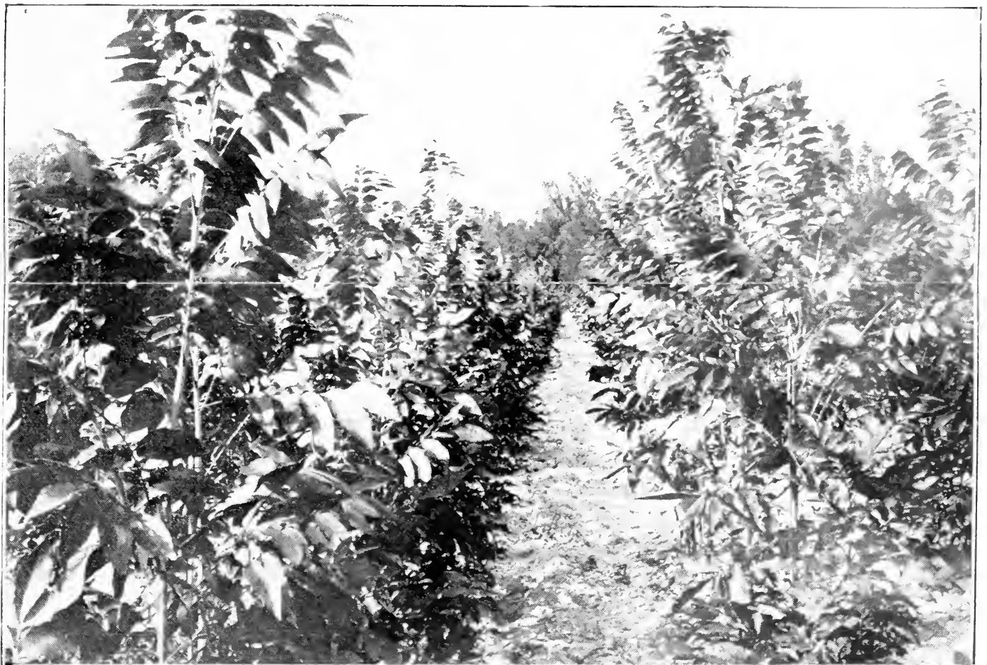
THIS PICTURE WAS TAKEN IN OUR NURSERY SEPTEMBER 8, 1927. BETTER PECAN TREES CANNOT BE GROWN.

This time the pictures are of Orchards from different locations here in East Texas, grown from trees out of our Nurseries, and we invite you to write any of these Parties for information about their orchards, and what they think of our trees.