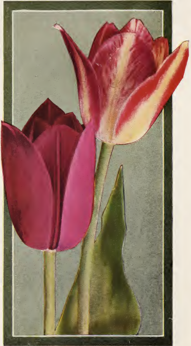
A splendid example of a Cottage Tulip. Its delicate shape and shading make it a great favorite.

Collection of 100 Cottage Tulips in a wide range of colors, named varieties, correctly labeled, for $4.00 prepaid.