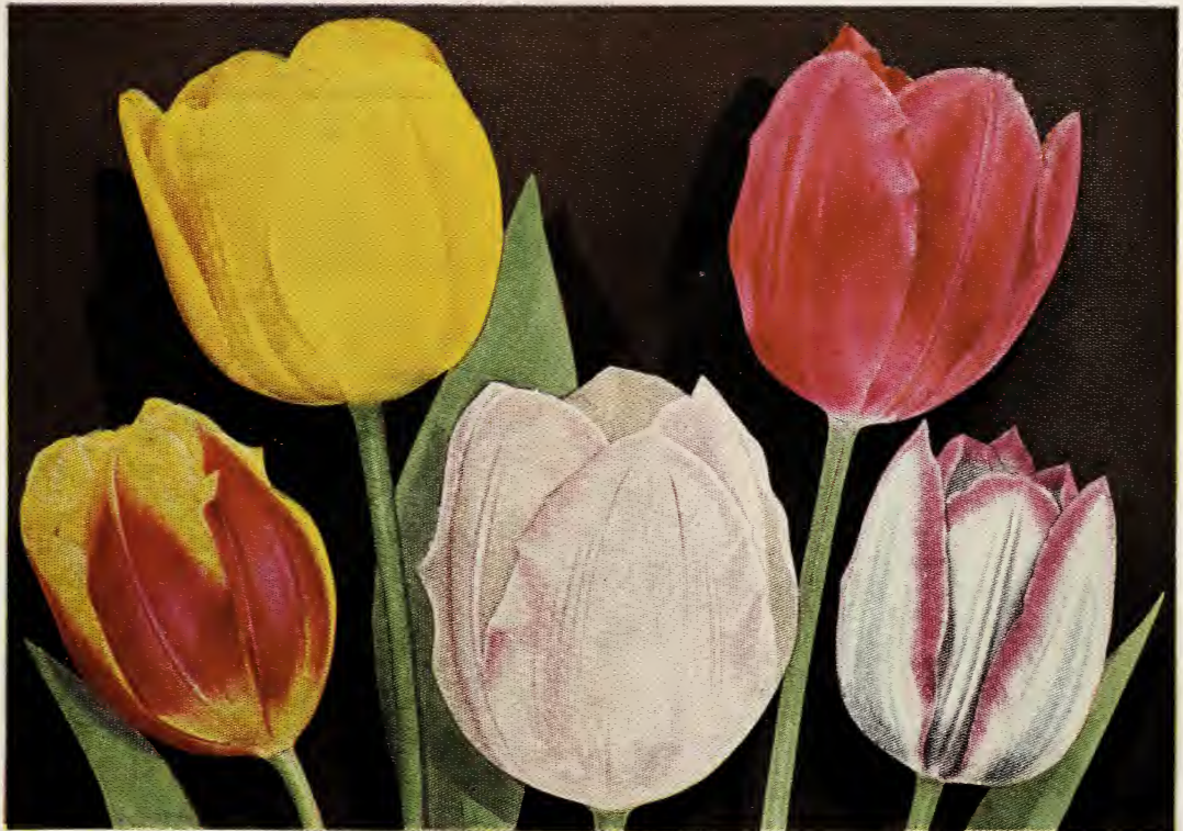
Plant early Tulips to lengthen the blooming season, and follow them with Darwin and Cottage Tulips.

Bulbs of Lord Carnavon, 20c each; $1.50 per 10; $12.00 per 100.