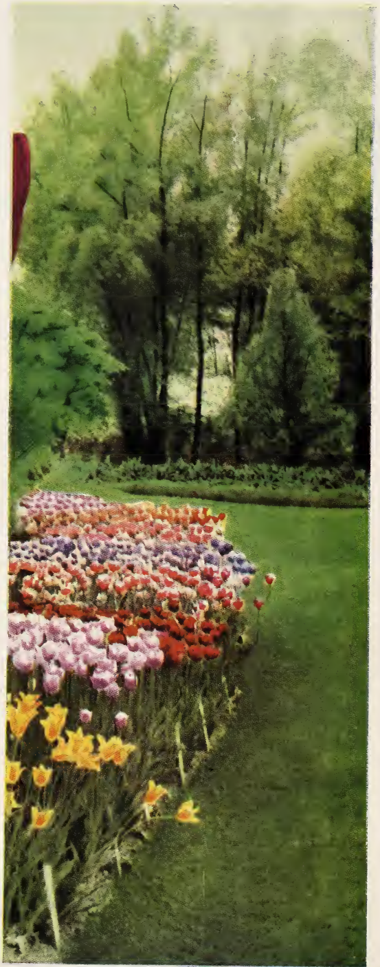
The glorious color of the Tulips is tempered by the more delicate shades of the early Spring background.

It is our purpose in the limited space available to briefly review the different species or classes of Tulips. Much confusion exists in the average mind as to what is meant by a Darwin, a Breeder or a Cottage Tulip, and indeed, it is a difficult matter in some instances to draw a distinct dividing line. During the many years of bulb cultivation in Holland, the industry has passed through many changes, and at certain stages one or another class of Tulips has reached the height of its popularity. Various species have been imported from other countries; these were crossed with the best existing varieties and these again crossed with other species, until today with some of our wonderful new varieties it is a difficult matter to say positively, this is a Darwin or this is a Cottage Tulip. However, most classes have certain characteristics by which they may be distinguished.