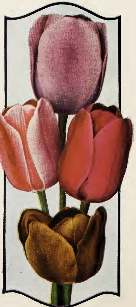
This illustration shows the marked difference between the Darwin and Breeder. The uppermost three are Darwins, while the lower one is a Breeder.

Write for quotations on larger quantities.