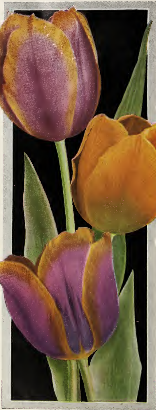
These colorful Breeders indeed pay tribute to the old Dutch hybridizers. Note particularly the strong contrasting colors and sturdy appearance.

There are many undesirable varieties among the Breeders, which, if you happen to plant as your first experience, would be disappointing. These are generally offered in mixtures and we have eliminated them from our list. We offer a collection of 100 bulbs in an assortment of the better varieties, all correctly labeled, for $7.00 prepaid. As is evident, this is not a competitive offer, but made with the hope of being able to place in your hands some of the choicer varieties, with which you will be greatly pleased.