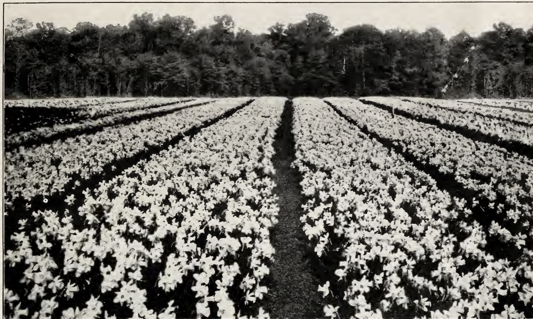
A field of Narcissi at our grounds at Corfu. This probably is one of the finest displays of Narcissi in this country, and it is repeated every year early in the Spring time.