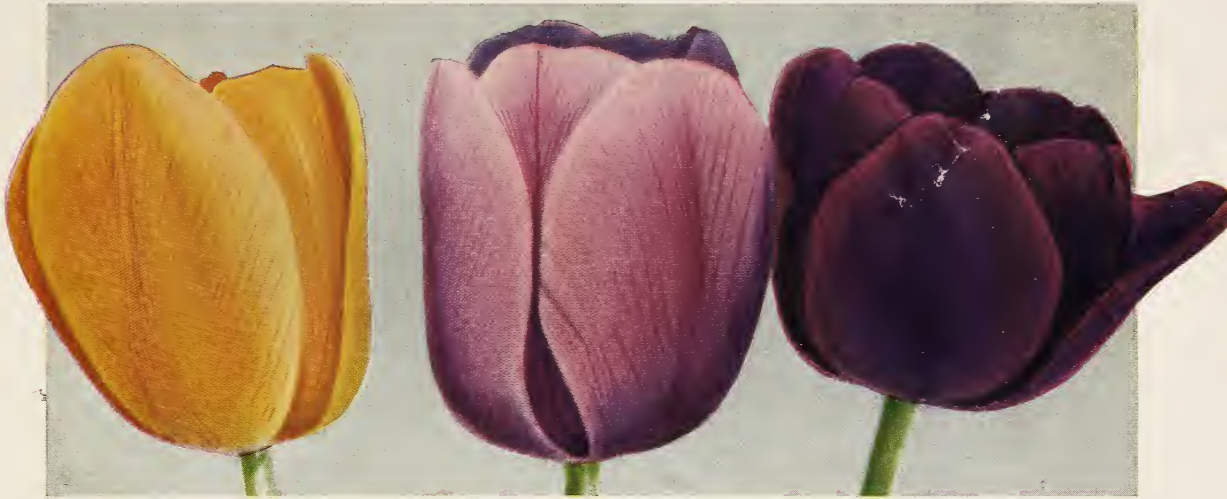
This illustration shows the contrasting colors in which the Darwins may be had.