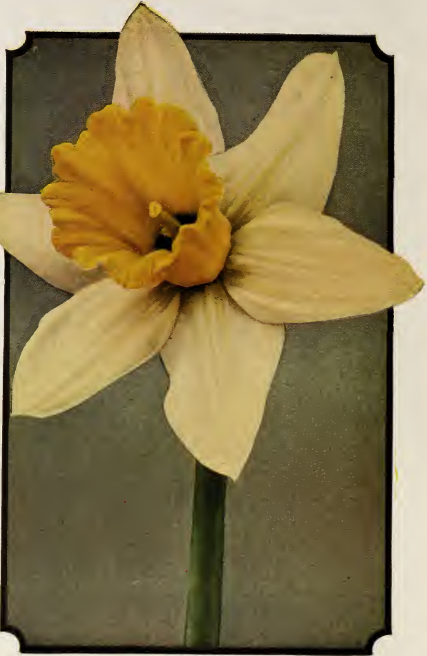
This illustration shows a long trumpet Narcissus and the apparent difference between the delicate shades of the trumpet and the outer petals.