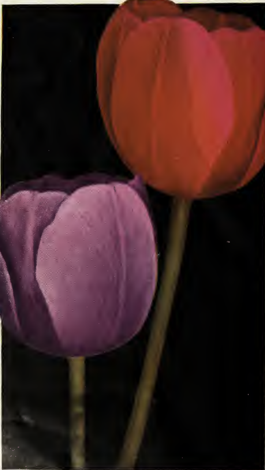
It is easy to distinguish the Darwin Tulip by its strong characteristics, which are shown in this illustration. There is almost an endless variety of colors to choose from.