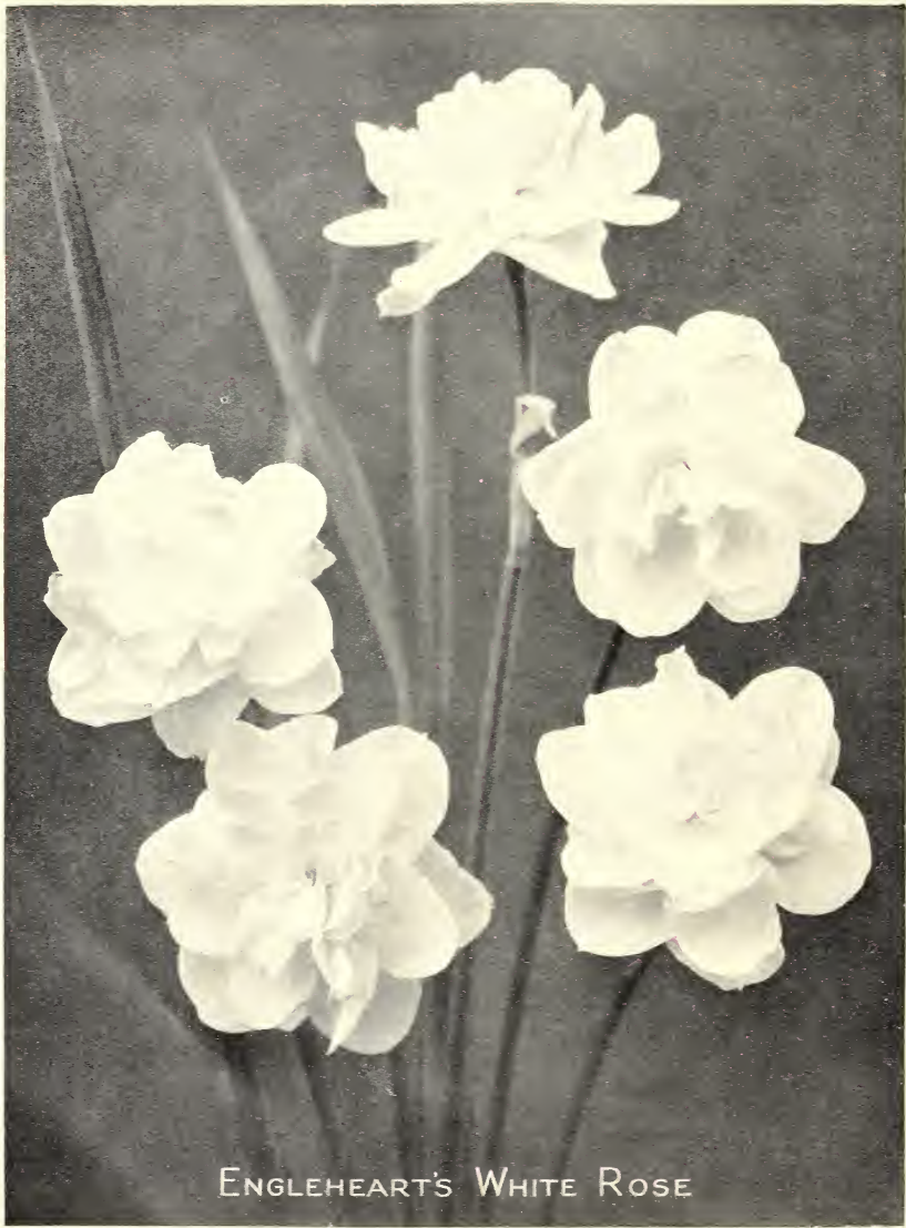
ENGLEHEART'S WHITE ROSE