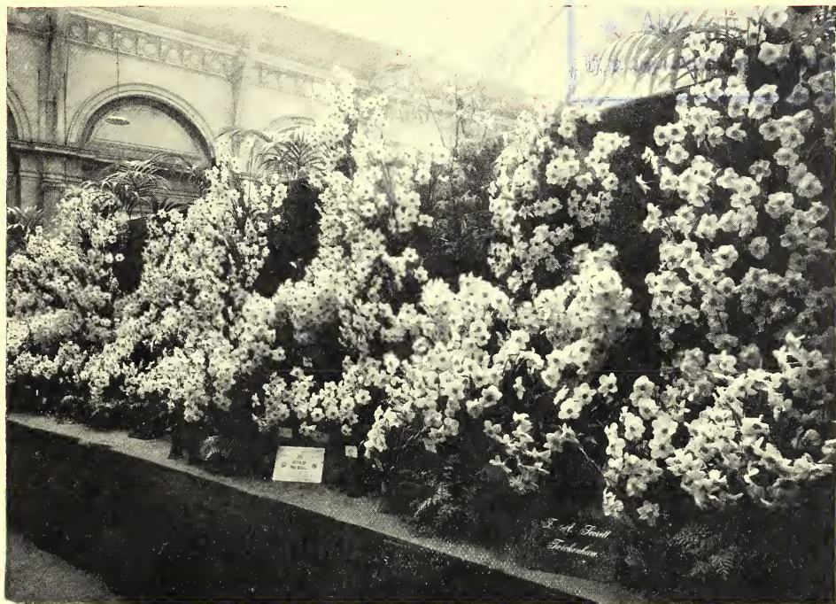
Exhibit at R.H.S. Daffodil Show, Vincent Square, April 17th, 1928.

NEW DAFFODILS suitable for MARKET GROWERS.