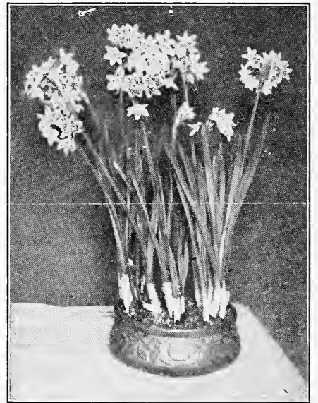
Giant White Narcissus Growing in Water

Wood's Superior Hyacinths IN SEPARATE COLORS WOOD'S SUPERIOR HYACINTHS in separate colors can be sold at considerably less price than where it is necessary to keep and name each individual bulb separately. These bulbs are all good sized flowering bulbs much larger than the ordinary mixed Hyacinths, and give excellent satisfaction for general forcing, for cut flowers, or outdoor garden blooming in beds or borders.