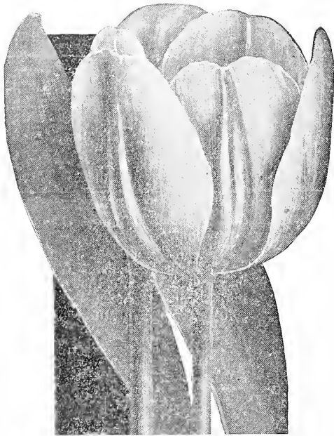
Clara Butt Darwin Tulip

We strongly advise our customers to take advantage of the very low prices of Darwin Tulips this season, as the indications are they will be considerably higher another year.