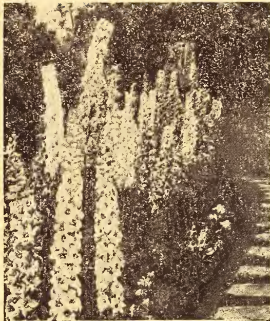
HYBRID DELPHINIUM (See Hardy Plants)