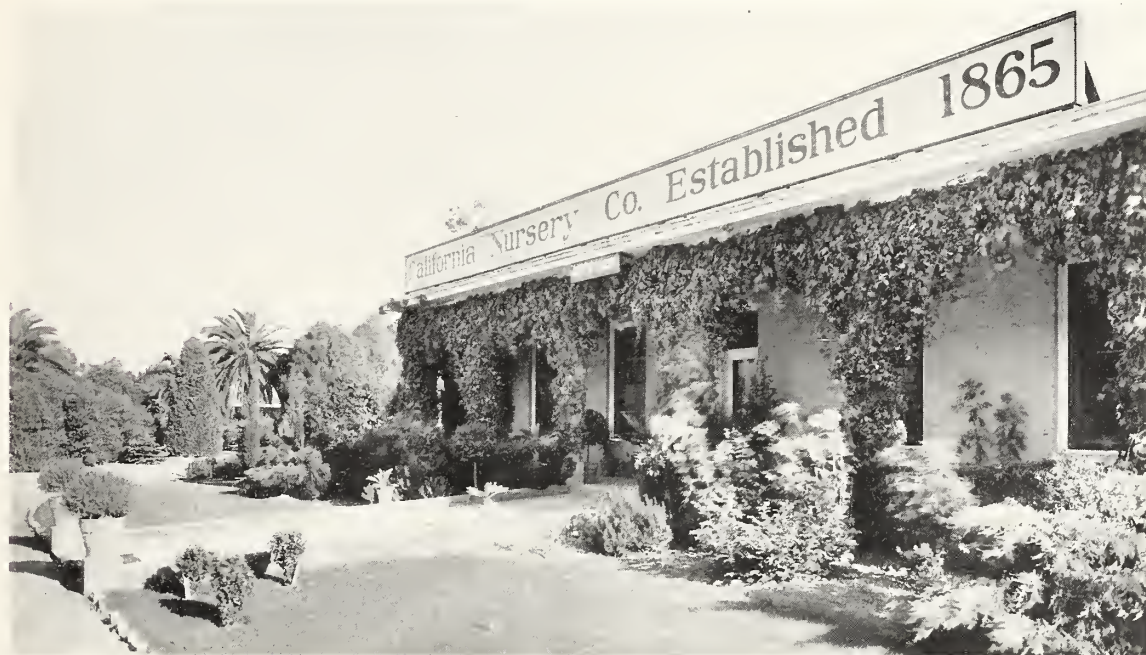
Home Office—Niles, California