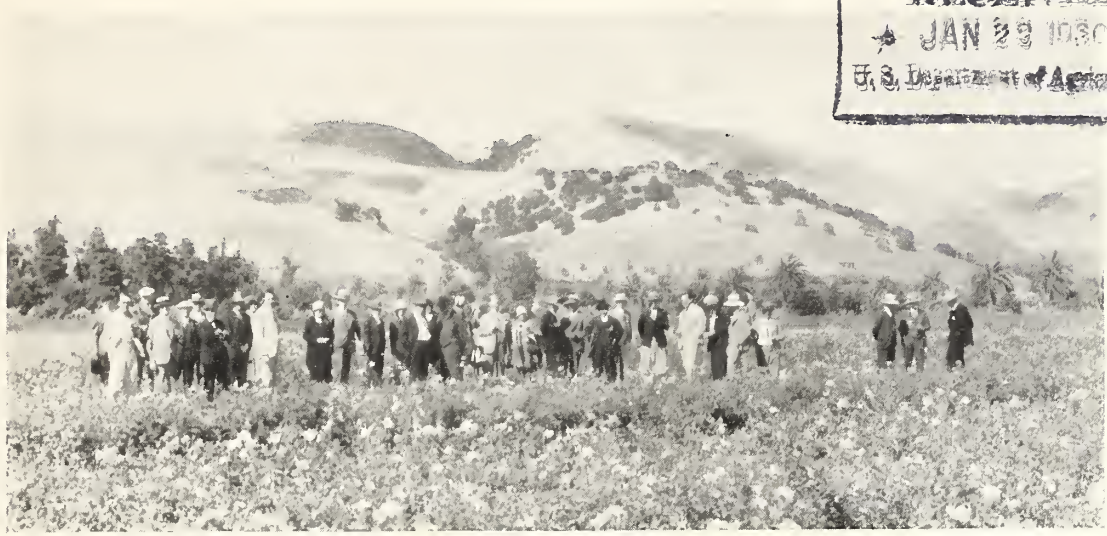
Delegates from American Association of Nurserymen Visiting Our Rose Fields July 1928

62.09 LIBRARY UNIVERSITY OF CALIFORNIA ★ JAN 29 1930 ★ U. S. Department of Agriculture