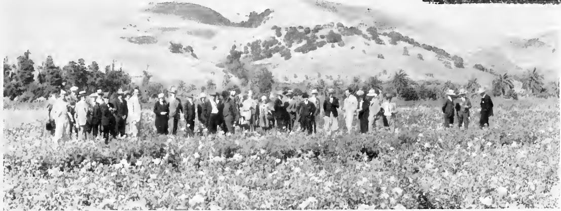
Delegates from American Association of Nurserymen Visiting Our Rose Fields July 1928

62.09 LIBRARY UNIVERSITY OF CALIFORNIA ★ JAN 29 1930 ★ U. S. Department of Agriculture