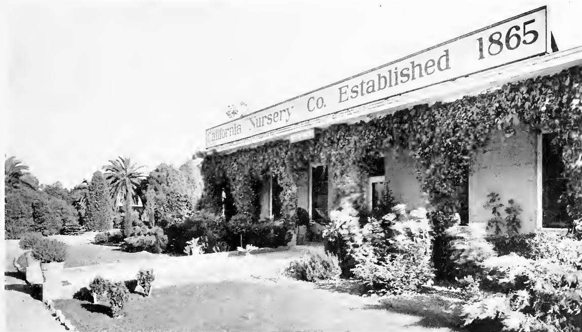
Home Office—Niles, California