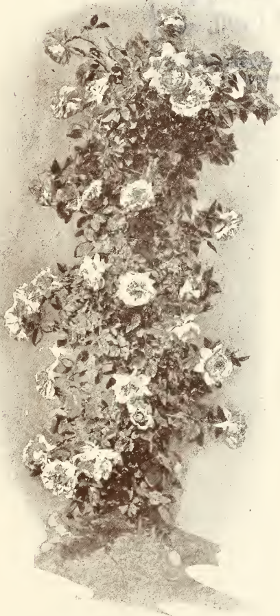
THE "TOTEM POLE" ROSE (Budded with "Louise Catherine Breslau") Made possible by the use of I. X. L. STOCK