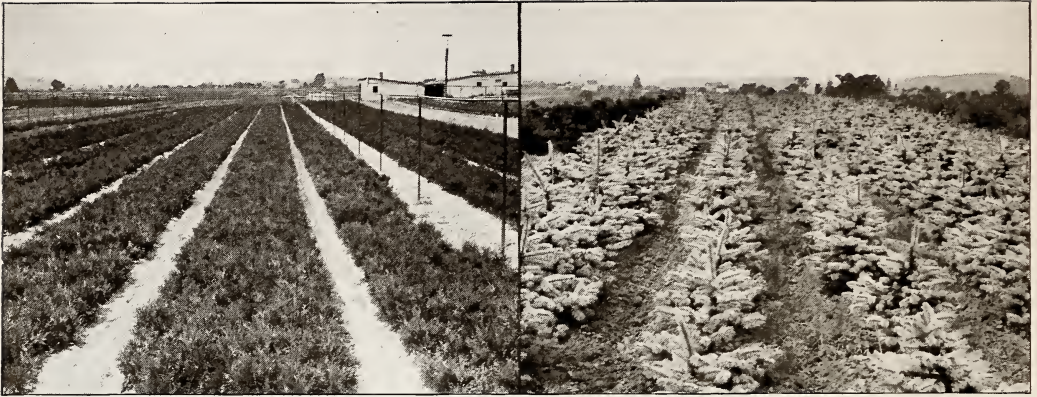
Left. Bedded Evergreens at Newark, showing American Arborvitæ. 3-yr. T. Photo. July 27, 1928. Right. Here are our first grafts of Koster's Blue Spruce. Not many offered for sale this year but photo. appears to show what we are doing. Photo. July 27, 1928.