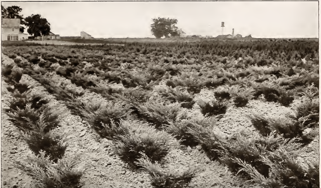
Evergreens are one of the Shiloh specialties. This photo shows Savin Juniper, Thuja gigantea elegantissima , and Thuja pyramidalis . Available in quantity this season. Photo. August 1, 1928