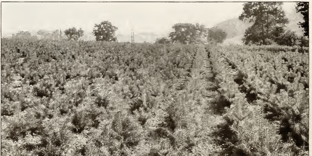
A block of young Scotch Pines at Newark. Photo. July 27, 1928