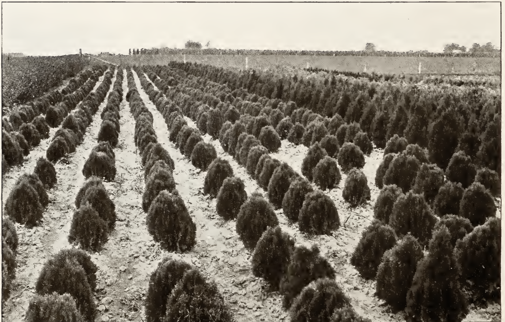
Biota aurea nana with Biota elegantissima at the right. At Shiloh. Photo. August 1, 1928