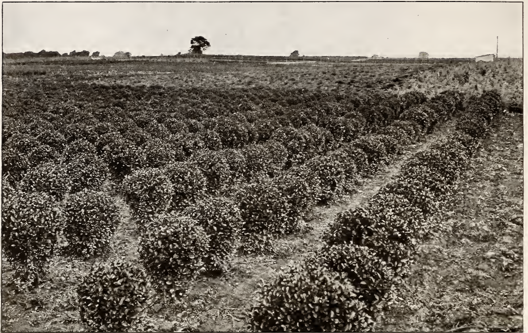
Ball-shaped California Privet in the foreground; Pfitzer's Juniper and Cedrus deodara in the background. At Shiloh. Photo. August 1, 1928