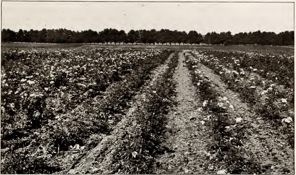
Part of our Newark block of Hybrid Tea Roses, showing (right to left) Souvenir de Claudius Pernet, Etoile de France, Mme. Alexandre Dreux, Kaiserin Auguste Viktoria, Mme. Butterfly. Photo. July 27, 1928