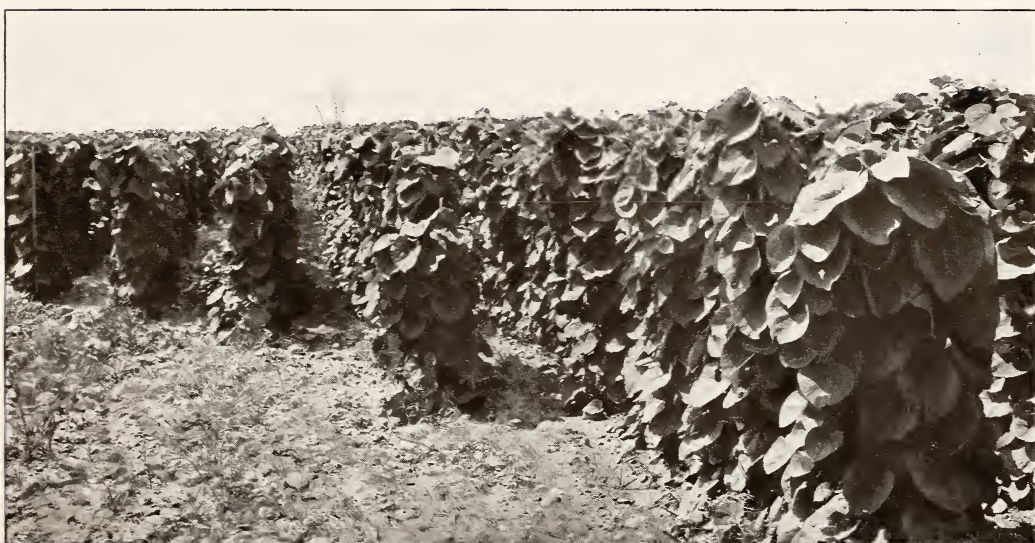
Dutchman's Pipe at Newark. Real he plants. True Aristolochia siphonifera. Photo. July 27, 1928