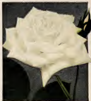
Kaiserin Auguste Viktoria