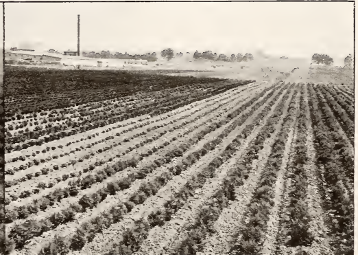
Left. Newark Pyramidal Arborvitae . Photo. July 27, 1928. Right. This is our second year in this new Propagating Department. Assorted Evergreens— Thuyas , Retinosporas , Juni- pers , 3-yr., T., and 4-yr., TT., also a general view of this new layout at Newark. Photo. July 27, 1928.