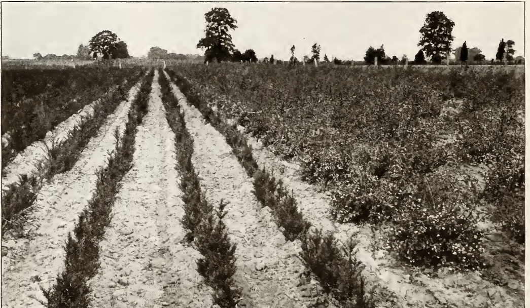
Taxus capitata and Abelia grandiflora at Shiloh. We call particular attention to the spacing and the development of our Abelias. Photo. August 1, 1928