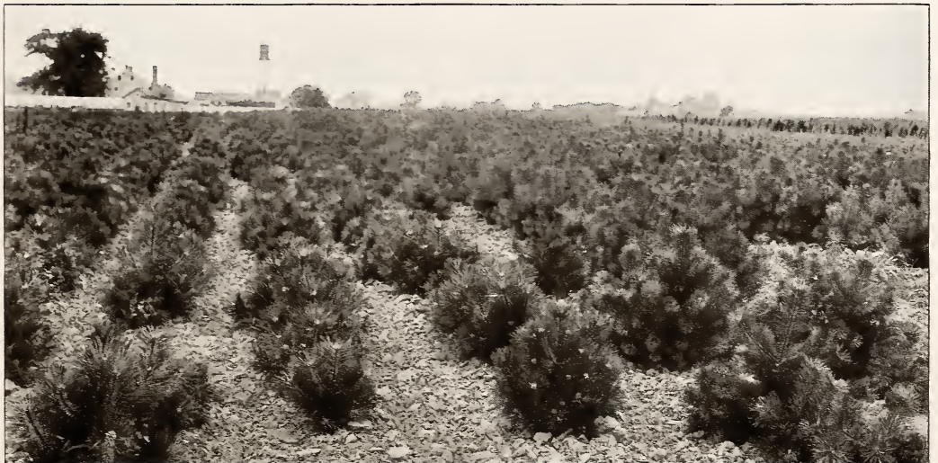
Pines at Shiloh. Scotch Pine in the center, Austrian Pine to the right. Photo. August 1, 1928