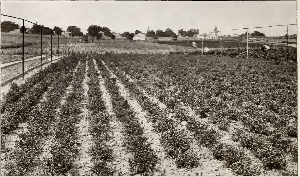
Azalea Hinodegiri is another Shiloh specialty. Note the care and spacing of these plants. Photo. August 1, 1928