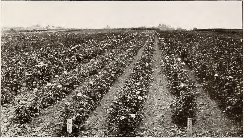
Left to right—Columbia, Betty, Mrs. W. C.-Miller, Lady Ashtown, Frau Karl Druschki. At Shiloh. Photo. August 1, 1928