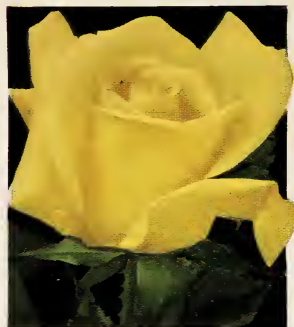
Souv. de Claudius Pernet