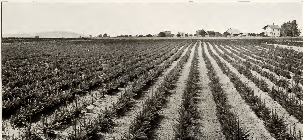
Norway Spruce in our Propagating Department, 4-yr., TT., containing good grafting stocks and extra-fine value for lining out. At Newark. Photo. August 1, 1928