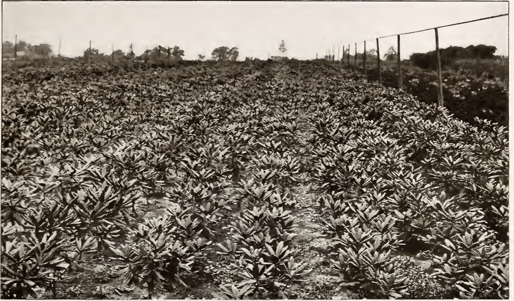
Hybrid Rhododendrons at Shiloh. Photo. August 1, 1928