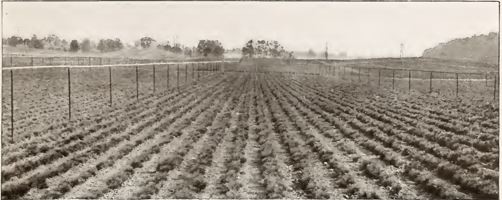
Real values in Pinus Mughus . Our strain is very dwarf. The seed is collected especially for us in the higher regions of the Alps. At Newark. Photo. August 1, 1928