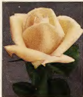
Duchess of Wellington