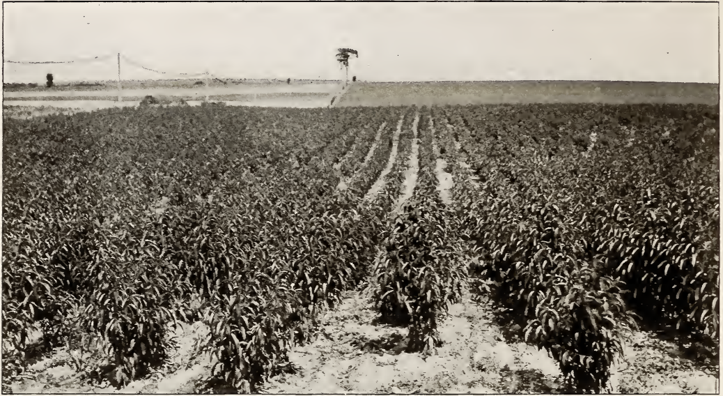
One end of our Peach block at Newark. Photo. July 27, 1928