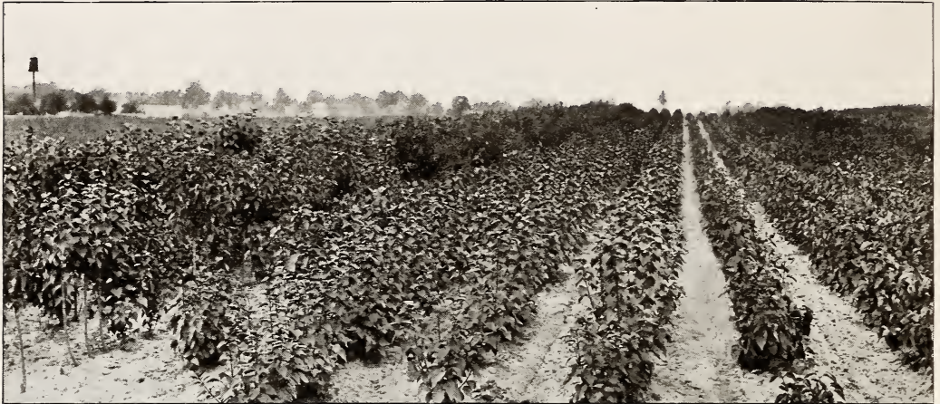
A part of our Shiloh block of tree-form and bush-form French Lilacs. Photo. August 1, 1928