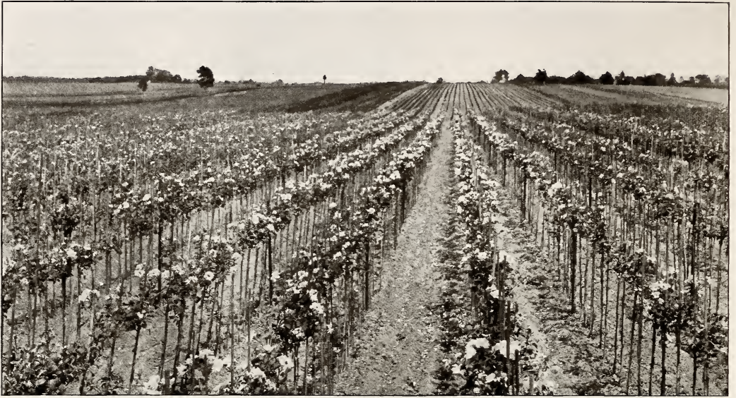
Standard Roses at Shiloh. Note heavy stems and double budded tops of trees offered this season