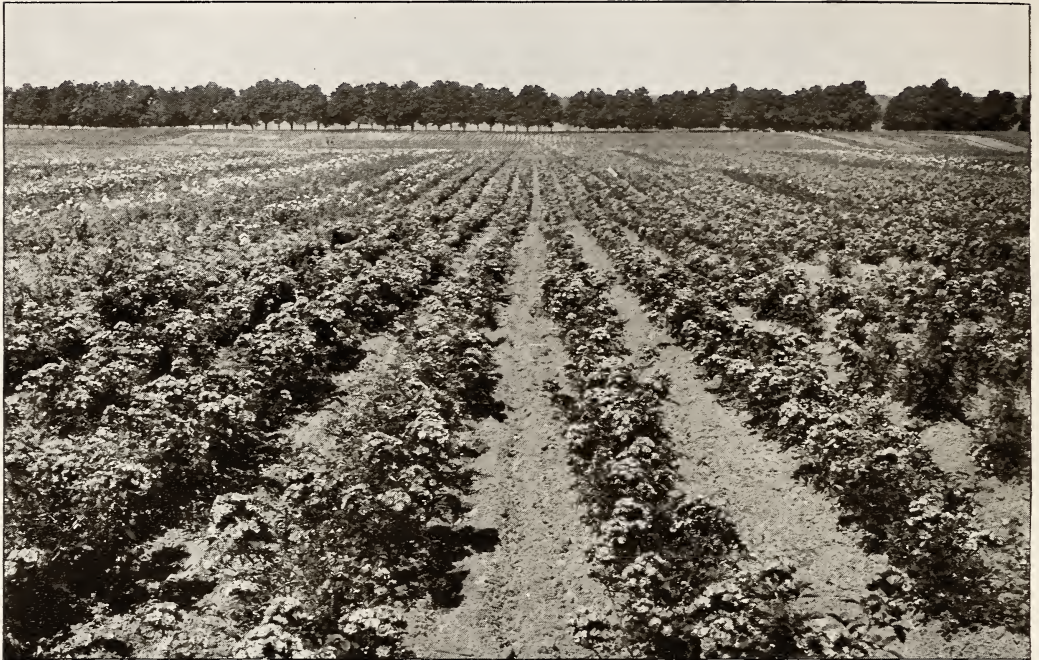
A general view of our Newark Rose block with Baby Rambler in the center and hybrid varieties on either side. Photo. July 27, 1928