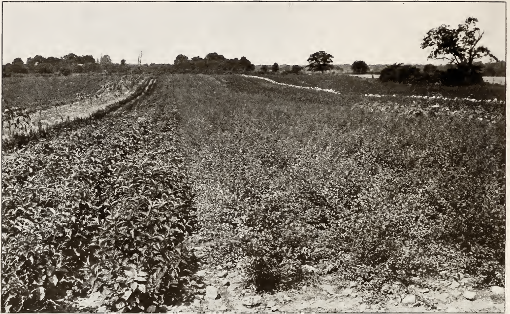
Newark common shrubs, Weigela floribunda and Spiraea Van Houttei . Photo. July 27, 1928