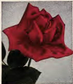
Etoile de France

A group of Hybrid Tea Roses selected for range of color, thriftiness, beauty, and adaptability to all parts of the country. They have been carefully chosen from a large collection of varieties as best worthy of maintaining the high standard set by the "J. & P. Preferred" Dozens of former years. Ready in autumn 1928 and spring 1929.