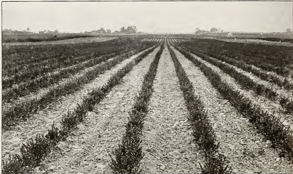
Boxwood at Shilch. Photo. August 1, 1928