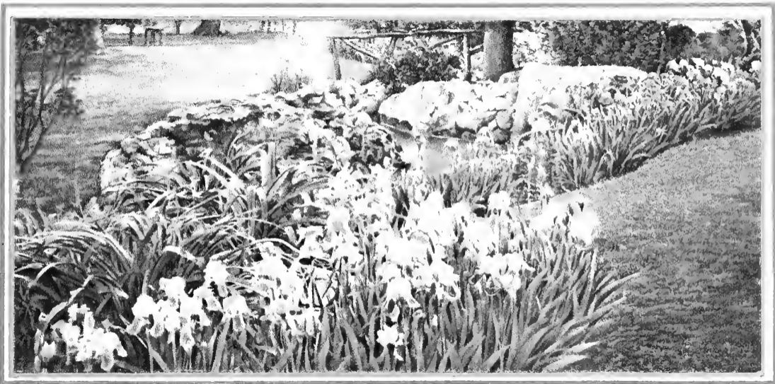
A normal increase from 21 Iris rhizomes should equal this planting in three to four years.