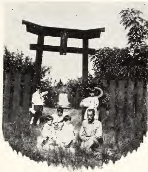
GATEWAY TO INNER SHRINE

One of my Japanese neighbors, a nurseryman, brought the children to "The Garden of Content", to see Buddha, inscrutable God of the East.