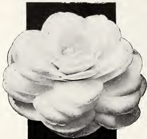
Lot 37 "Longview"