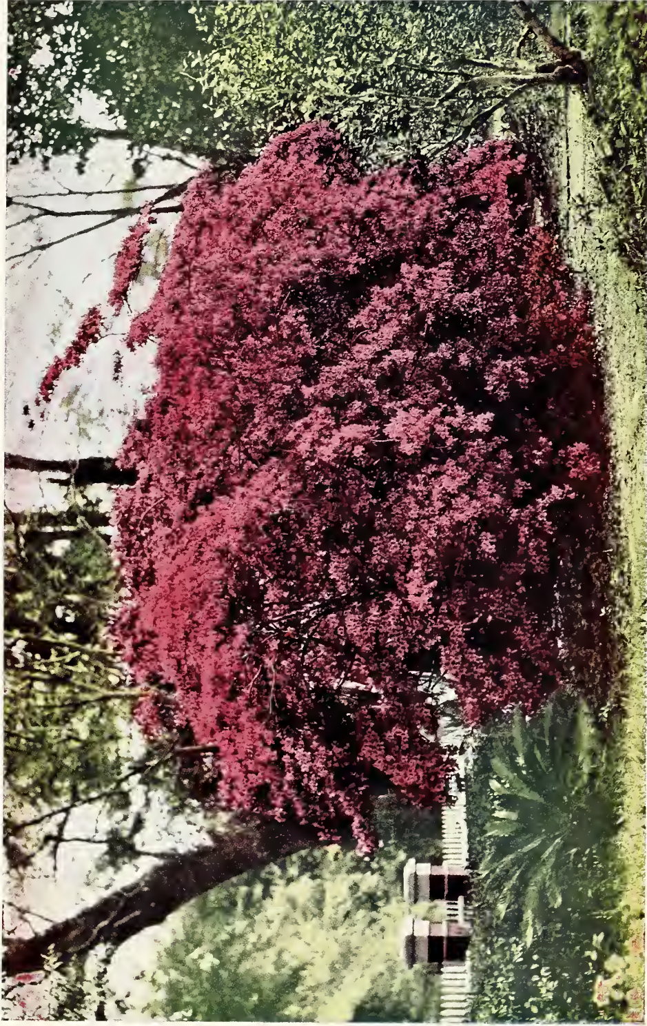
Our watermelon pink Azaleas, Lot 5-A, are propagated from these shrubs.