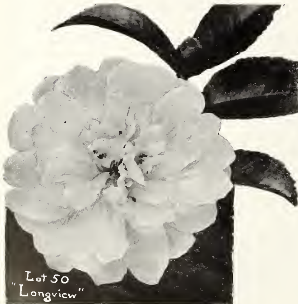
Lot 50 "Longview"

Lot 46, Early blooming clear cherry, rose form.