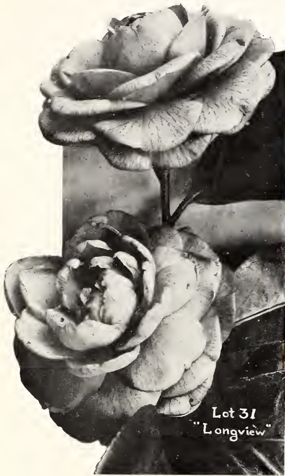
Lot 31 "Longview"