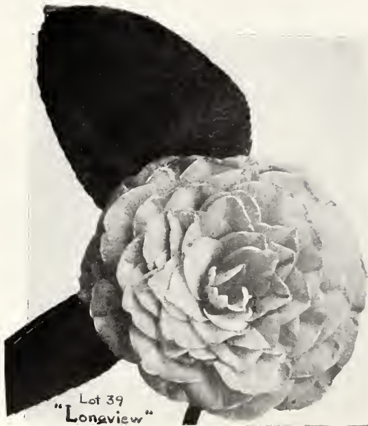
Lot 39 "Longview"