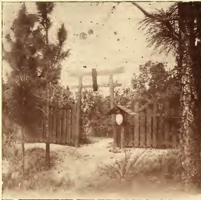
Entrance to Japanese Garden at "Longview"

RECEIVED JUN 1 1936 U. S. Department of Agriculture