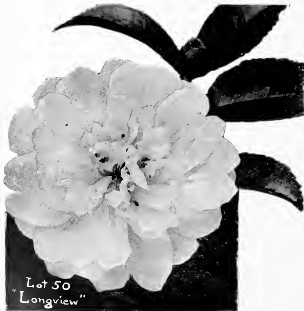
Lot 50 "Longview"

Lot 46, Early blooming clear cherry, rose form.