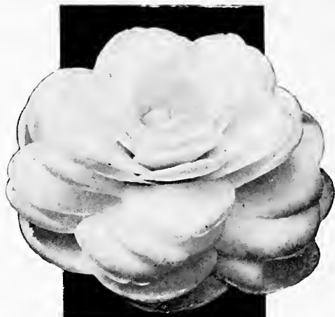
Lot 37 "Longview"