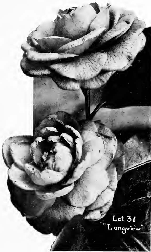
Lot 31 "Longview"