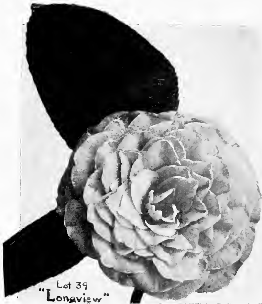
Lot 39 "Longview"