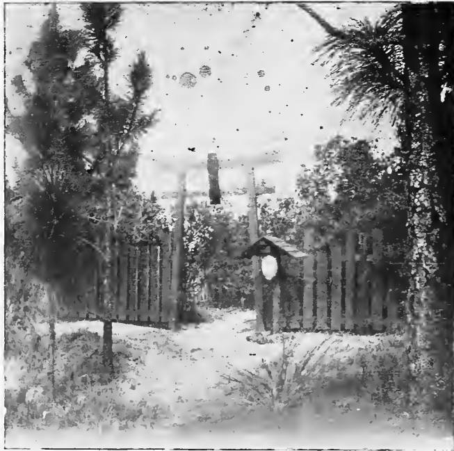
Entrance to Japanese Garden at "Longview"

JUN 1 1936 U. S. Department of Agriculture