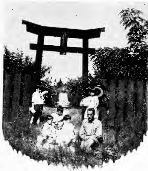
GATEWAY TO INNER SHRINE

One of my Japanese neighbors, a nurseryman, brought the children to "The Garden of Content", to see Buddha, inscrutable God of the East.