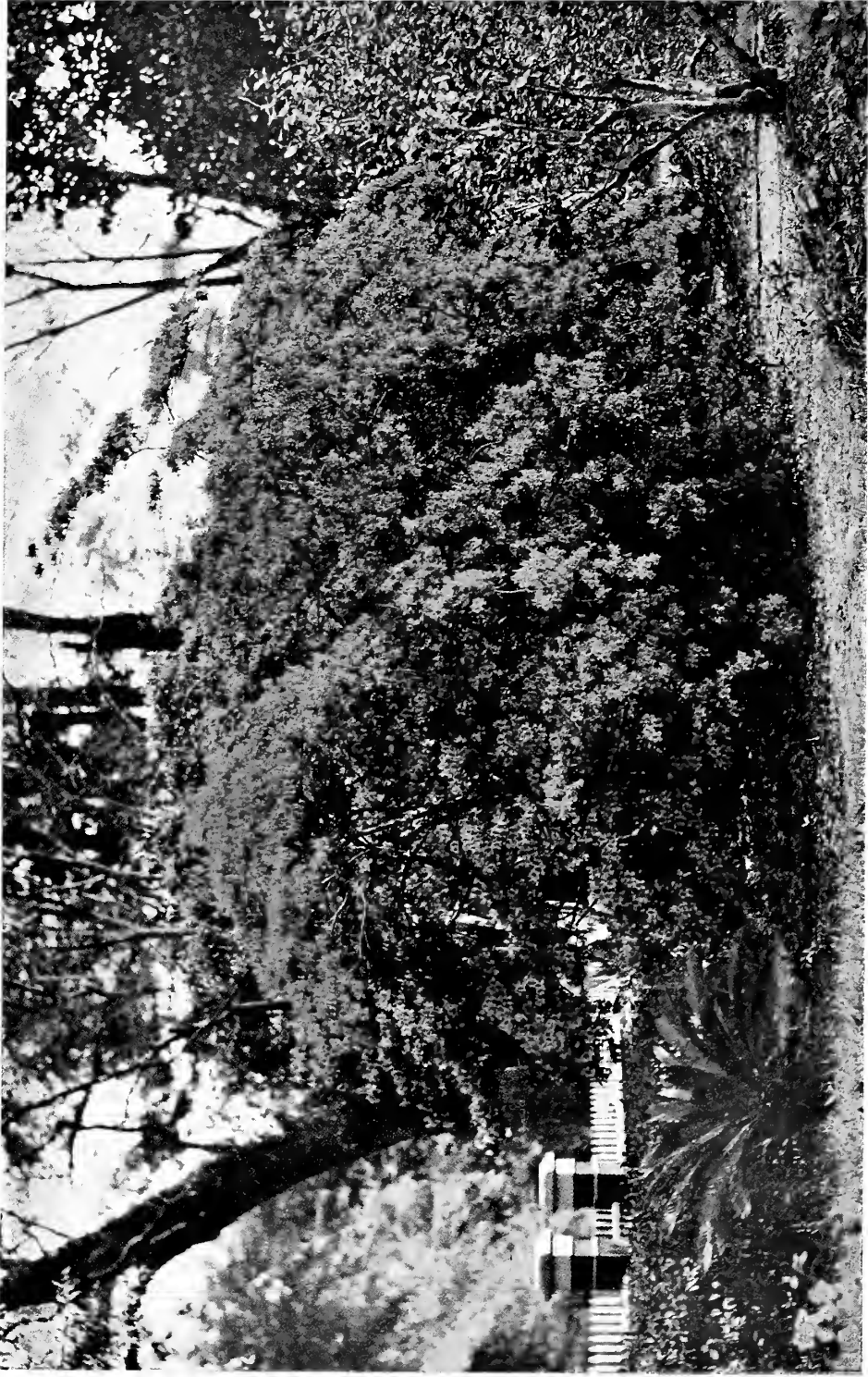
Our watermelon pink Azaleas, Lot 5-A, are propagated from these shrubs.