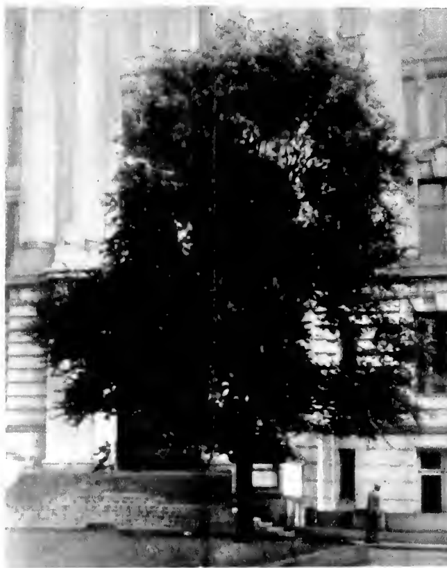
Left —Shows a Siberian Elm in front of the State War and Navy Building, Washington, D. C. Planted in 1920 as a whip, it is now 12 inches in caliper (diameter).