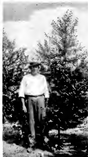
Below —A Siberian Elm planted May, 1928, at Garden City, L. I. Growth, 5 feet in 5 months. The tree can adapt itself to moist climate as well as dry.

T HESE photographs tell the story of the Siberian Elm better than words. It is a story of a tree so friendly and faithful that it will fit into almost any situation and quickly bring fresh, green foliage.