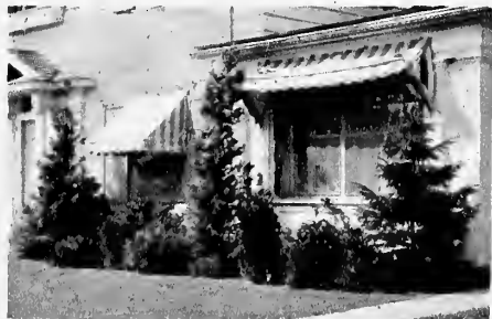
The above photograph shows what can be done with Guild Trees after a few years of growth. The tall growing trees punctuate the dwarf varieties. A few dollars invested now will grow into many dollars worth of trees in four or five years.

Instruction in planting, care and fertilizing is offered free to every planter of Guild Trees. Growing trees is a fascinating pastime—and brings amazing results if you use the best stock. You don't need much ground.