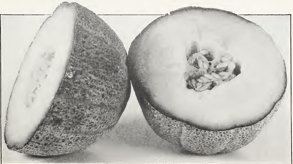
Hearts of Gold Melons are positively the best and most rapid selling market variety.

Arkansas. Have always made good money on your Hearts of Gold, selling as high as $2.50 per dozen and seldom less than $1.50.