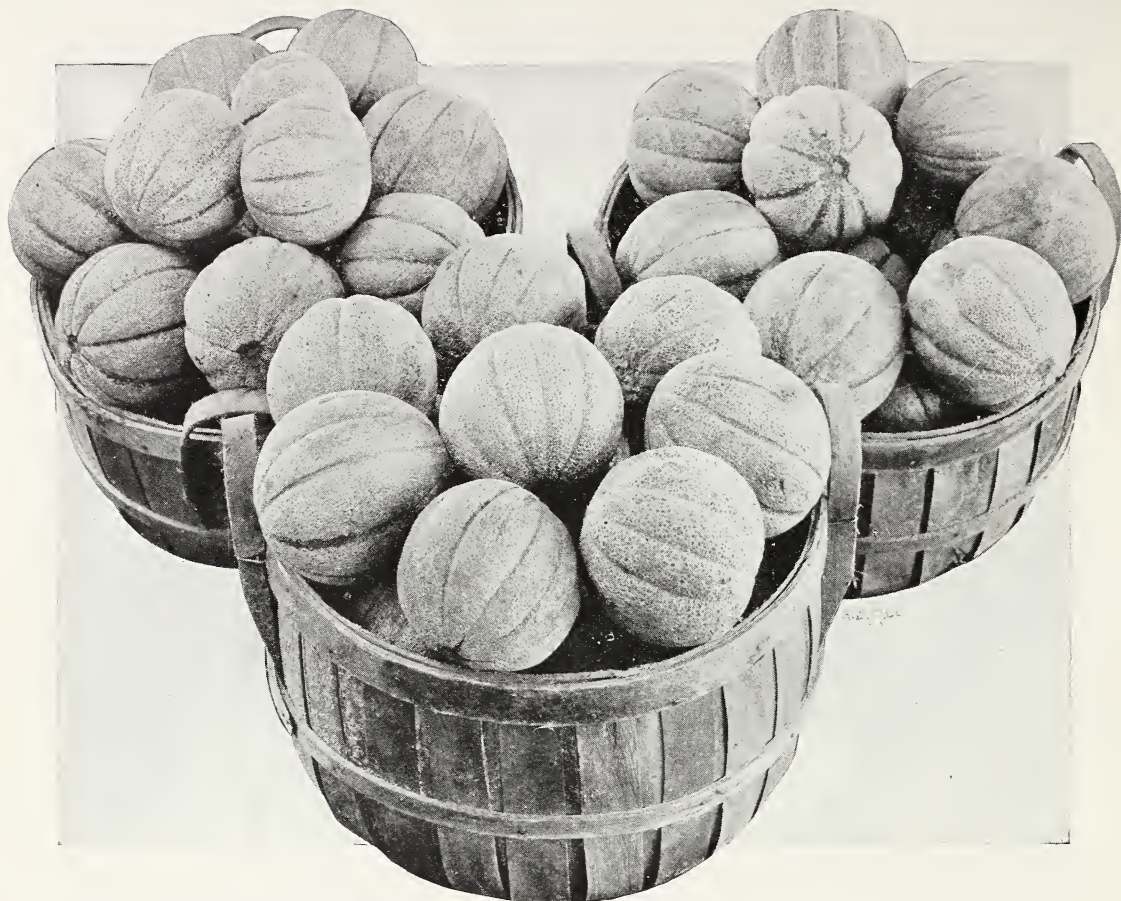
This engraving was made from photo taken on our farms last Summer, showing the Hearts of Gold type of seed stock.

Maryland. The Hearts of Gold melons shipped on our order were very delicious and I hope an "ad" for us both. I intend to plant only Hearts of Gold and from seed purchased from your house. My loss this year by fake Hearts of Gold seed from common seed store runs into several hundred dollars. I am just as proud of your extraordinary business service and accommodations as I am of your Special True to Name seed. I thank you kindly.