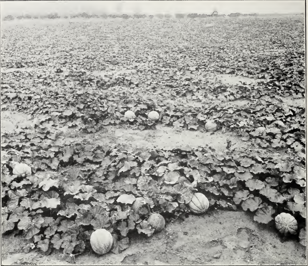
Looking East in one of our fields. Packing houses in the distance.

Kentucky. Have been purchasing Hearts of Gold seed from you for the past ten years and have found them very satisfactory.