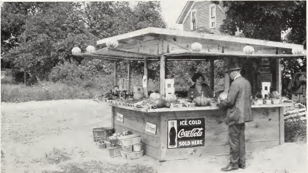
A Lucrative and Independent Business.

Indiana. Had wonderful success with our 15 acres of your Hearts of Gold cantaloupes. We sold them all right here at our place, selling as high as $700.00 in a single day. There was not a blighted vine in the field and vines were green as midseason when frost came. We are planning on forty acres next season and can sell every melon.