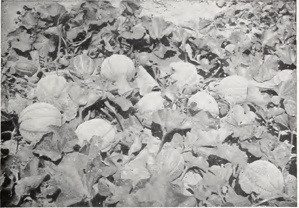
This engraving was made from a photo of one vine of Hearts of Gold Melons. There were 13 marketable Melons on the vine when the photo was taken.

Michigan. Your strain of Hearts of Gold cantaloupes are the finest we have ever grown.