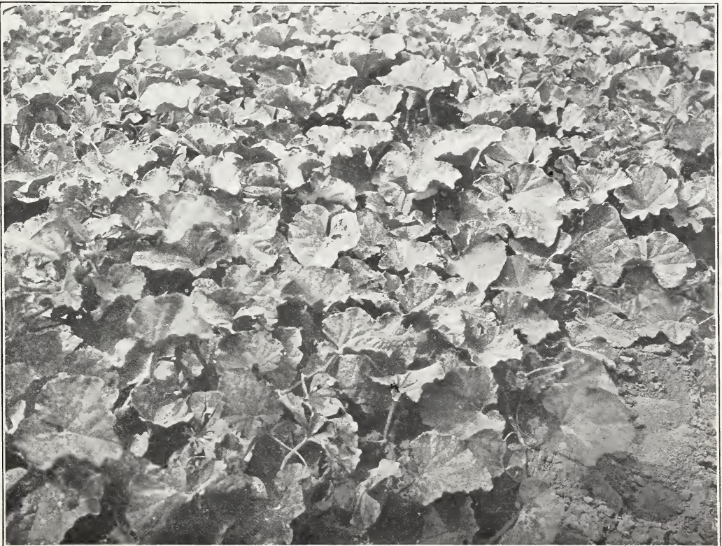
A strong, healthy growth of vines is a characteristic of Hearts of Gold as grown by us.

We furnish you enough seed for $4.00 to plant an acre. The cost of growing an acre in open field culture allowing yourself full wages should not exceed $25.00 up to picking time. Under the glass and transplanting method they might cost $75.00 per acre in labor and material. Planted 4x6 feet gives 1750 hills per acre. Damage by bugs, cut-worms, etc., should not reduce final crop below 1500 hills per acre, and it is a poor hill that does not yield four fine melons. Many will mature 10 to 15 melons on good land and 10 to 20c each is a fair price for Hearts of Gold. They find ready sale anywhere as soon as sampled and their wonderful flavor discovered at from $1.50 to $2.00 per dozen. Do not think because common varieties will not always sell that the same is true of the Hearts of Gold as there is no fruit grown that has such a demand as Hearts of Gold where once introduced.