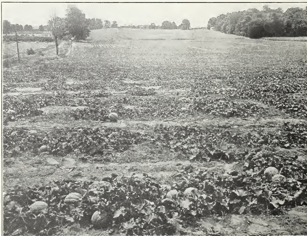
Field of Hearts of Gold Melons. This photo was taken on the Morrill farms. Note the excellent foliage growth. The field was sprayed six times, hence entirely free from rust.