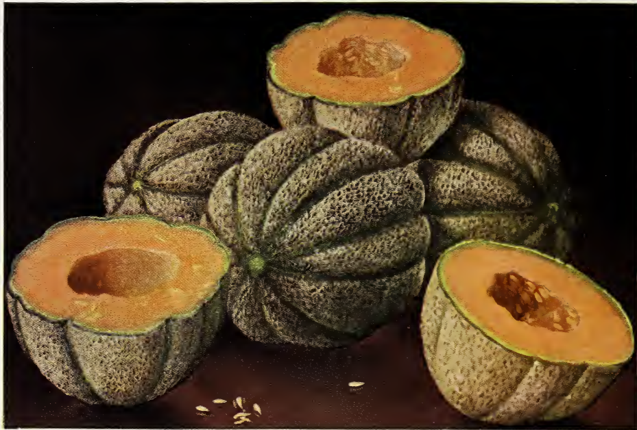
Note the thick, yellow meat and attractive appearance of the originator's strain of Hearts of Gold Melons.