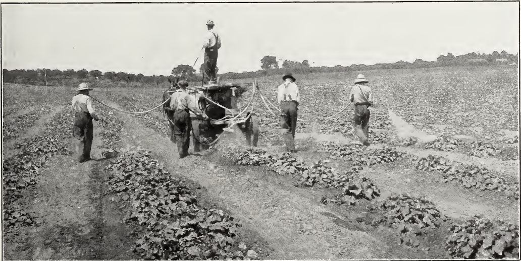
Spraying Melon Field. We Spare No Expense to Keep Our Vines Free From Disease.

"Pink Meat" type of cantaloupe has completely captured the best trade with the Hearts of Gold far in the lead where introduced. Already we hear with regret of plans to cheapen it by methods known to seedsmen but we shall continue to improve the variety by selection of perfect specimens from perfect vines.