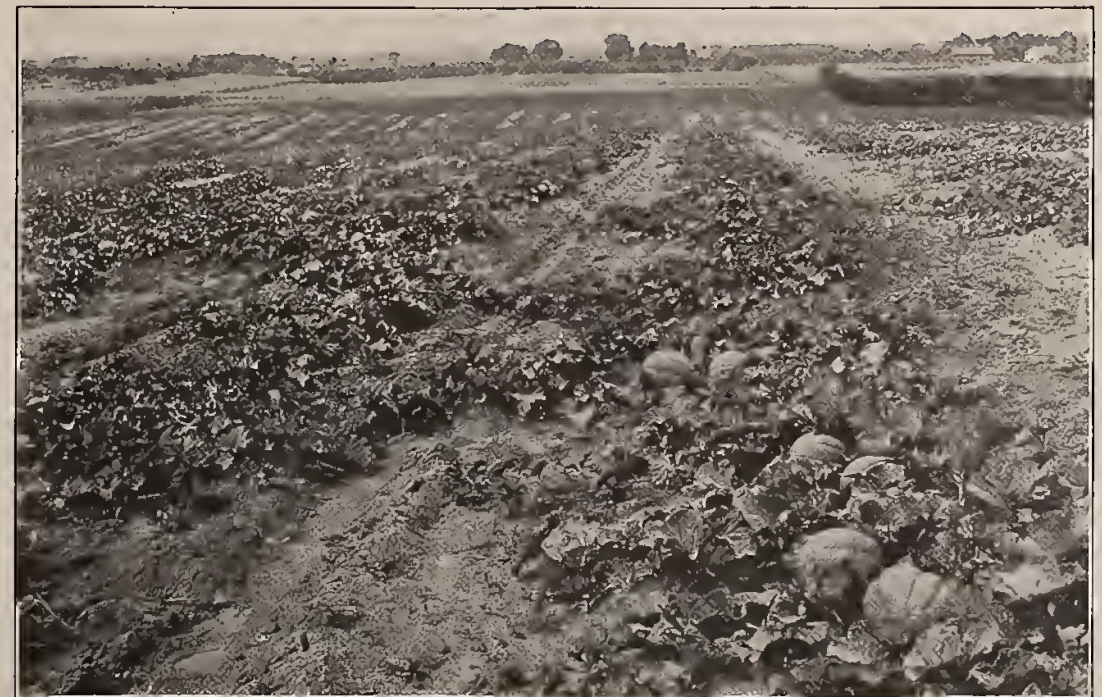
A view of our fields in August, 1928.

Please note the illustrations carefully. Please note particularly the actual size photograph of the half melon on the cover, also the thickness and color of the flesh. Its diameter is 5\frac{1}{4} inches and the seed cavity is 1\frac{3}{4} inches diameter. The thick flesh is dense but tender when ripe, the rind is about the thickness of an orange peel and about as tough. The one thing which we cannot illustrate or describe is the flavor and that is what puts Hearts of Gold in a class by itself and brings every customer back for more. The photo from which this engraving was made was taken on our melon farms, near Benton Harbor, in August, 1922,