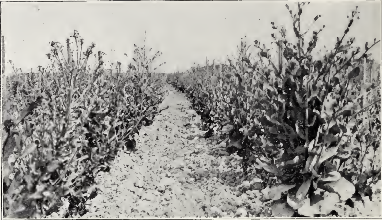
Reed Bros. Cabbage Seed Growing in the North Country. Note How Vigorous It Is.