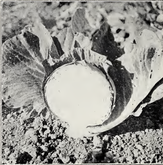
Glory of Enkhuizen cut in half.

The Glory seed we offer here was grown in the same north section as our Danish. We believe this seed to be exceptionally hardy and free from disease.