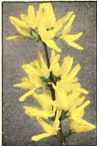
Forsythia (Golden Bell)

There are several varieties of Forsythia , but the one shown above is the one we all know. It blooms in late March. If you cut branches in January or February and put them in water in a warm room, the flowers will open in a few days.