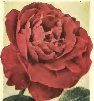
Gruss an Teplitz