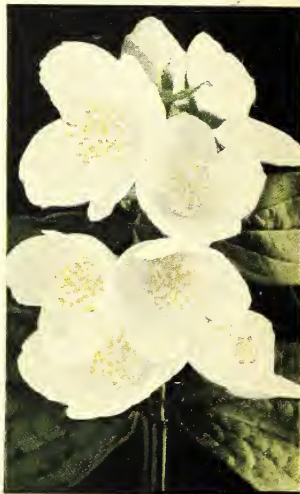
Syringa (Mock Orange)

Or you may have Nine of any 50-cent shrubs listed in our 1929 Catalogue for $3.50 . You can have shrubs that will bloom all summer, and save a dollar on the price.