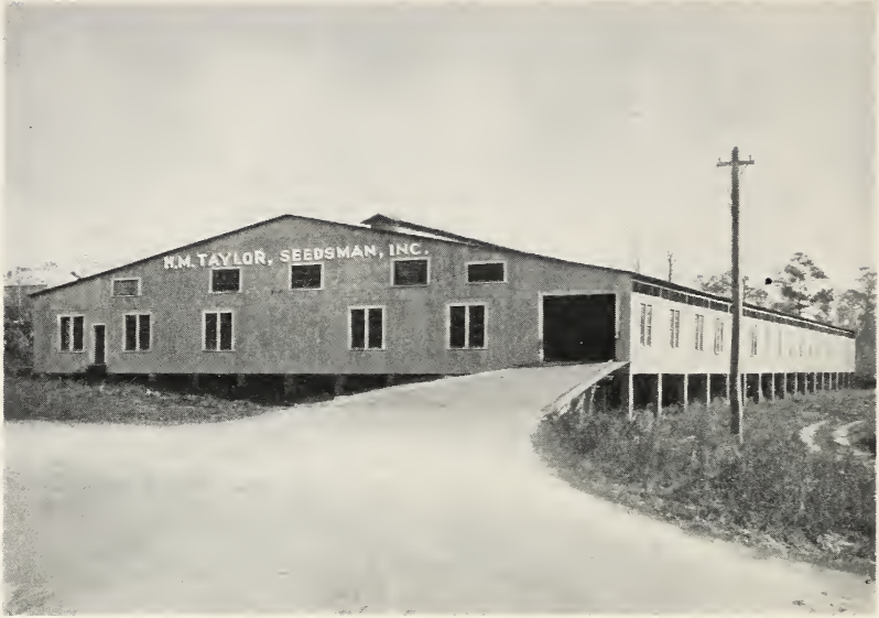
Our Quincy Warehouse Contains 43000 Square Feet of Floor Space.