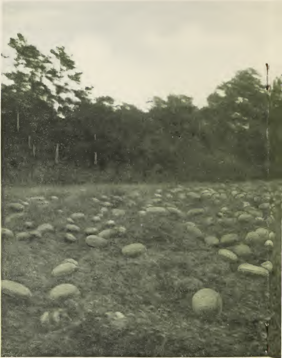
A FIELD OF "FLORIDA"