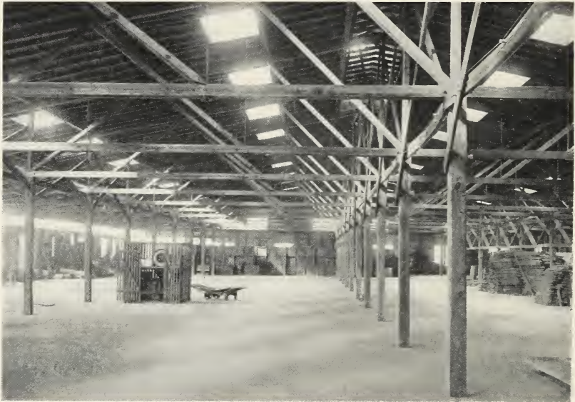
Partial View of Interior of our Quincy Warehouse, Nearing Completion Note Exceptional Ventilation and Equipment