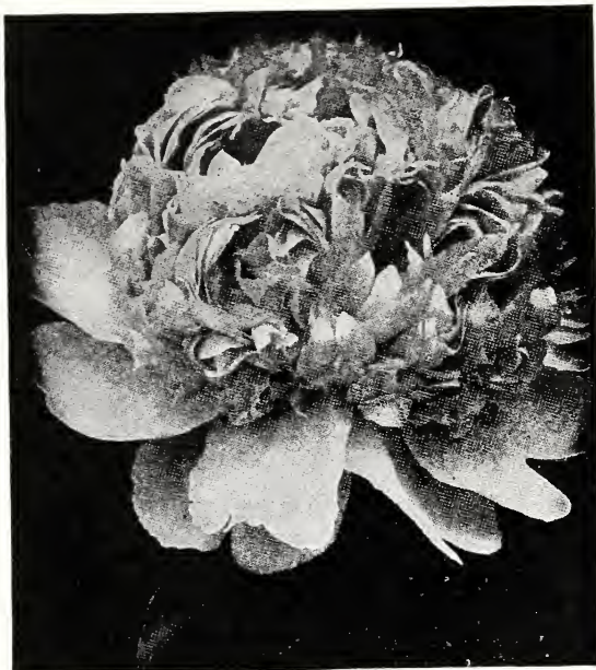
Peony — Alexander Dumas, 50 cents each. (One-third actual size.)

DUK D'WELLINGTON. (Calot 1859.) Large bomb type. White guards, and sulphur-yellow center. One of the finest white varieties. Medium tall, vigorous grower, free flowering. Very fragrant. Mid-season to late. 50 cents each; $5.00 per dozen.