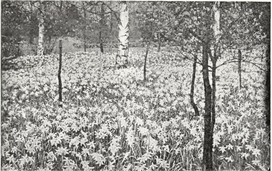
Large-flowering Narcissus "Emperor" one of the best for naturalizing.