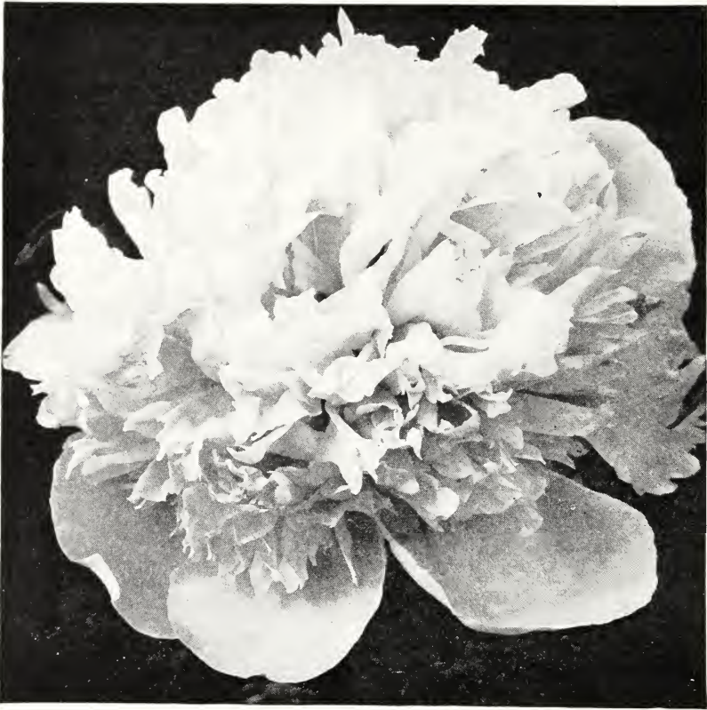
MARY BAKER EDDY — $2.00 (See Page 11)