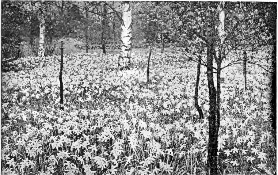
Large-flowering Narcissus "Emperor" one of the best for naturalizing.