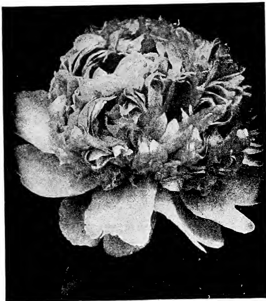
Peony — Alexander Dumas, 50 cents each. (One-third actual size.)

DUK D'WELLINGTON. (Calot 1859.) Large bomb type. White guards, and sulphur-yellow center. One of the finest white varieties. Medium tall, vigorous grower, free flowering. Very fragrant. Mid-season to late. 50 cents each; $5.00 per dozen.