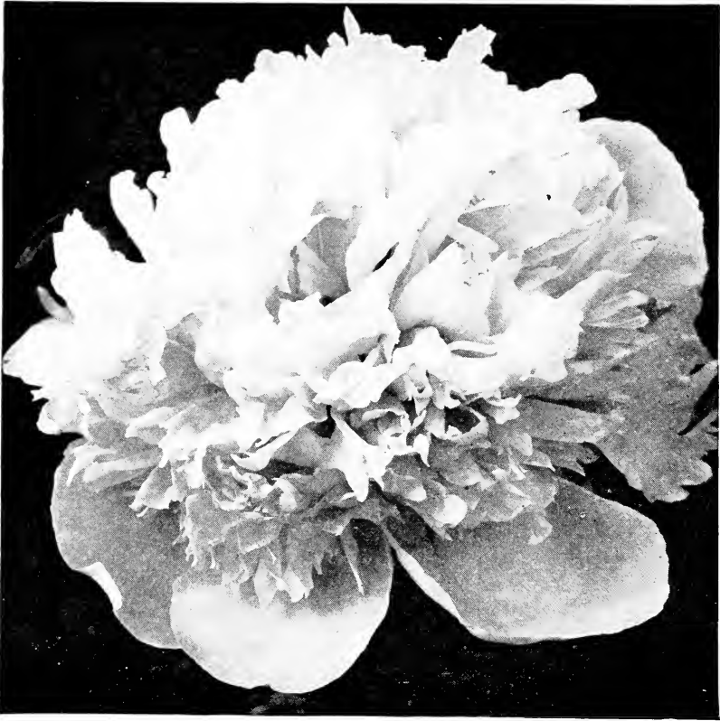
MARY BAKER EDDY — $2.00 (See Page 11)