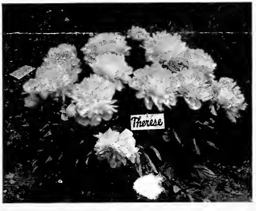
This shows easy reading arrangement

The zinc label is held firmly to the standard and the label may be tilted by bending the wire so it is visible without stooping. Names easily applied with metal marking pencil and writing is permanent.